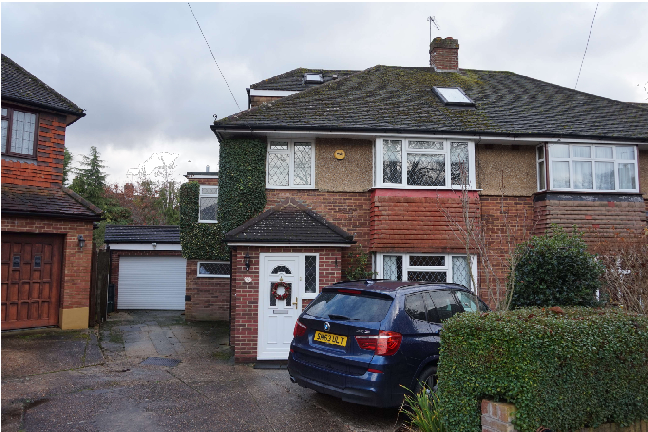
FRONT ELEVATION (no change)