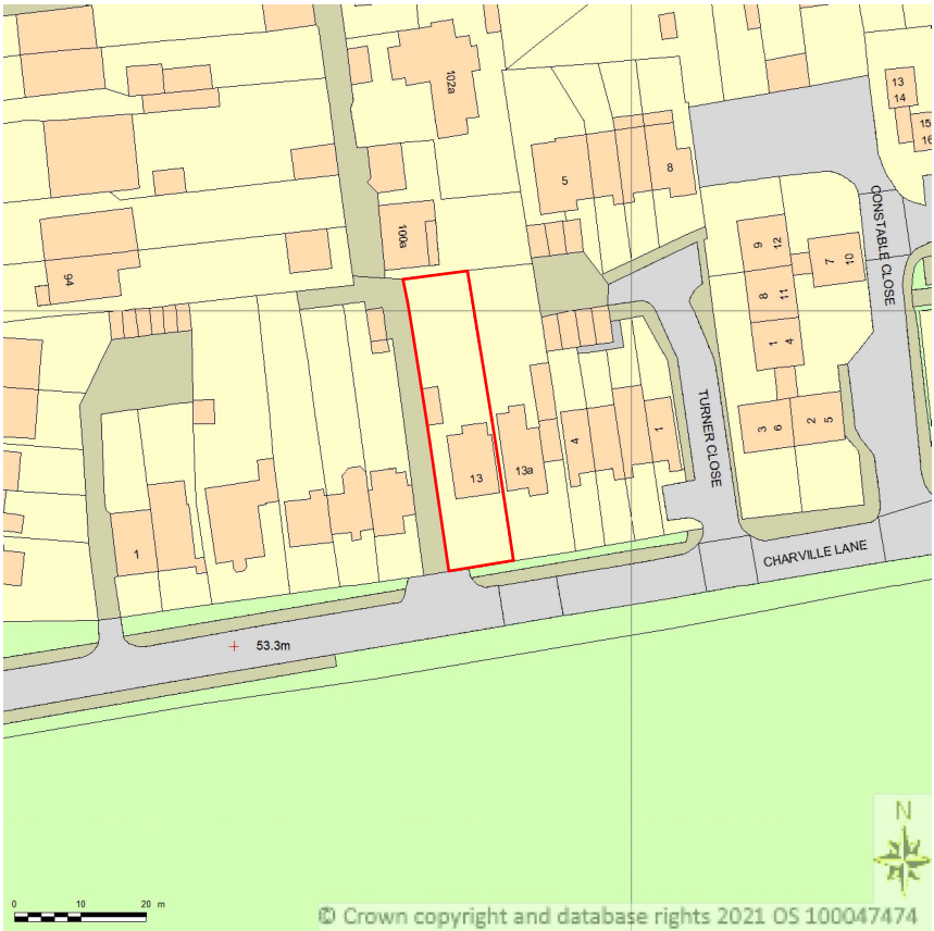
Location Plan@ 1:1250