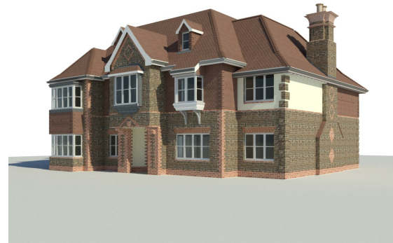
View from southeast (front right)