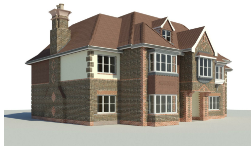
View from southwest (front left)