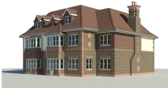
View from northwest (back left)