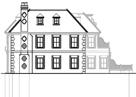
East Elevation (RHS)