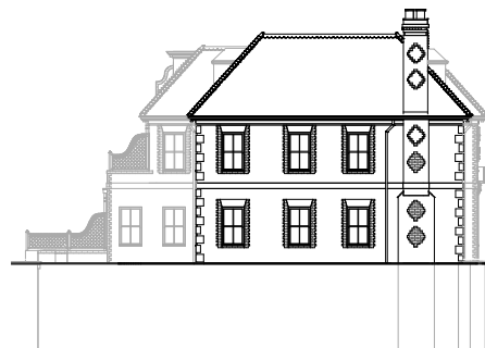
West Elevation (LHS)