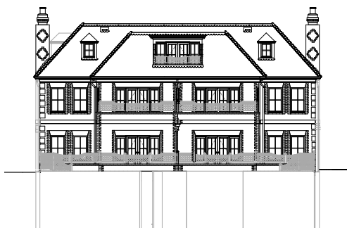
North Elevation (Rear)