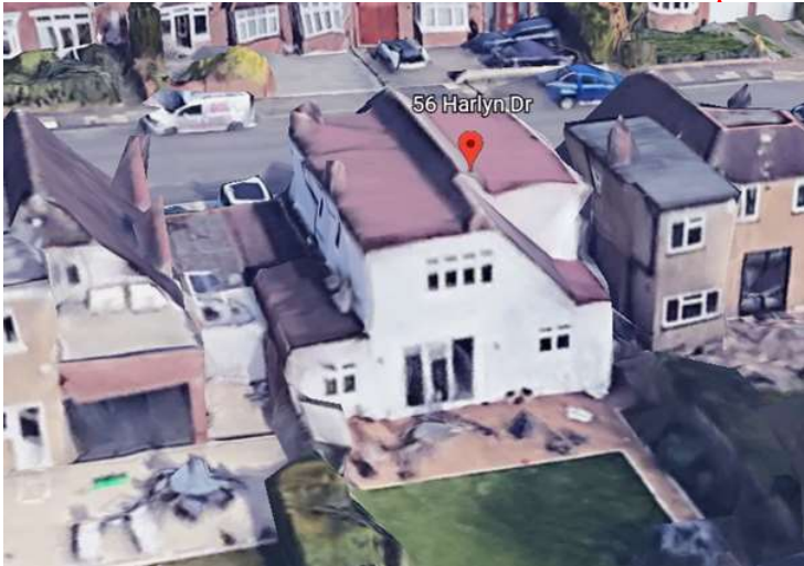
Rear extension to match 56 Harlyn Drive

Approx dimensions in blue Showing considerable distances between detached properties: 14 Chamberlain way side 1500mm = new extension and boundary 3000mm = between 12 and 14 Chamberlain Way 10 Chamberlain way side 2350mm = new extension and boundary 4350mm = between 12 and 10 Chamberlain Way