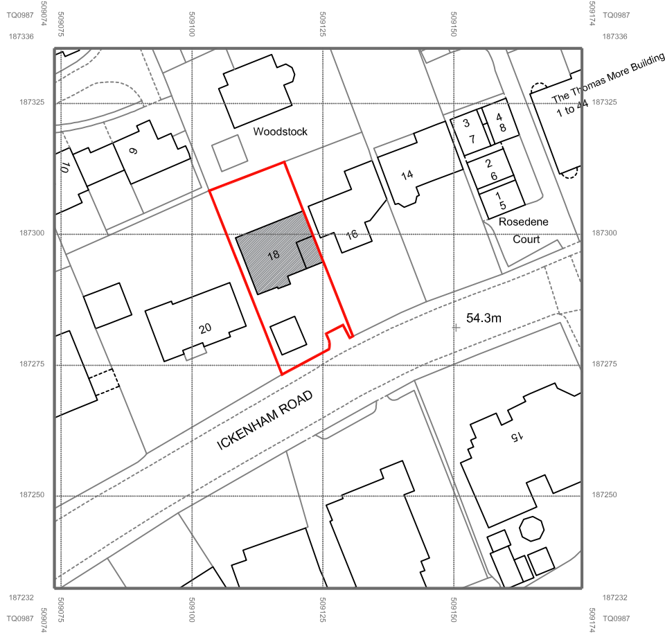
Location Plan Scale 1:1250@A3