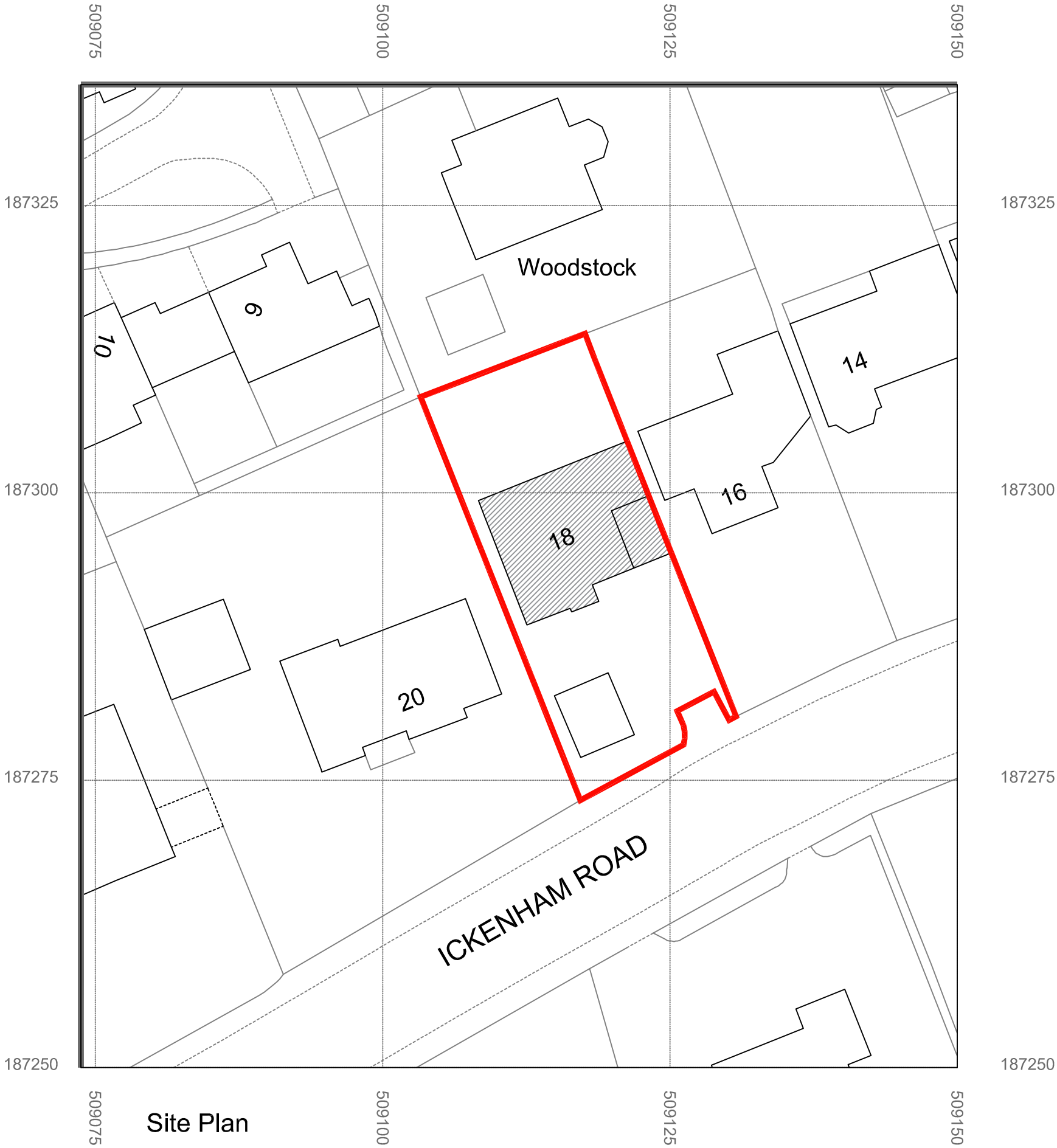
Site Plan Scale 1:500@A3