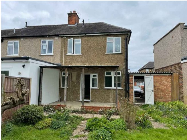
03 - REAR VIEW