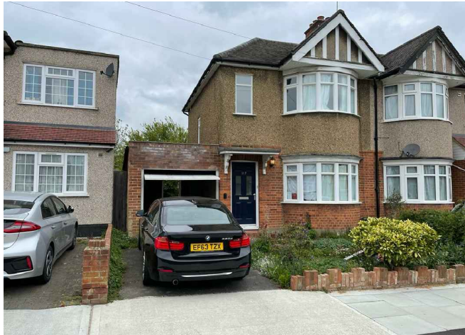
01 - FRONT VIEW