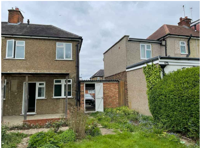
02 - REAR VIEW