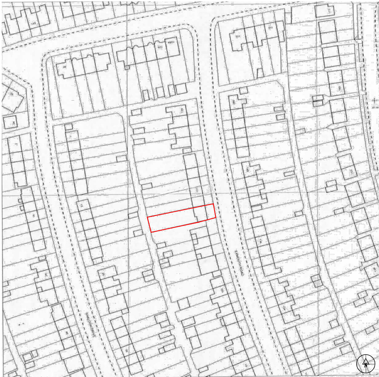
05 - OS MAP SCALE 1:1250