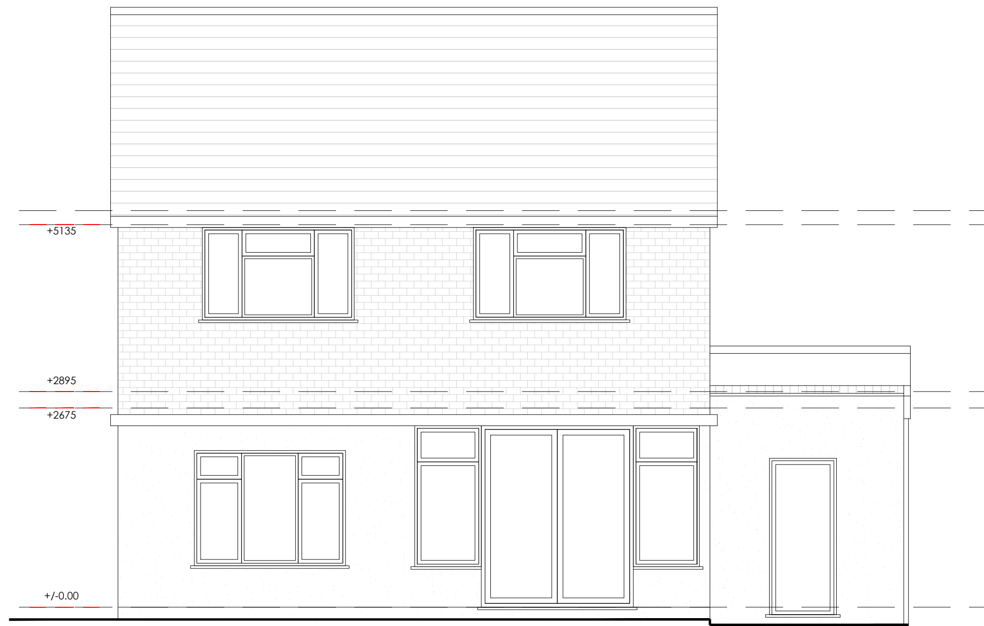
EXISTING Rear Elevation scale 1:50 @ A1