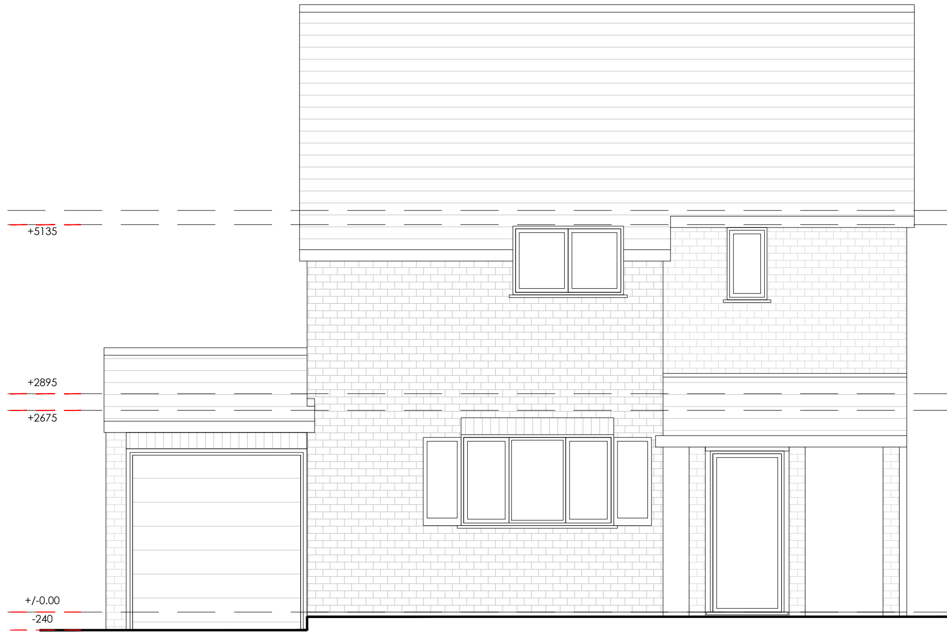
EXISTING Front Elevation scale 1:50 @ A1