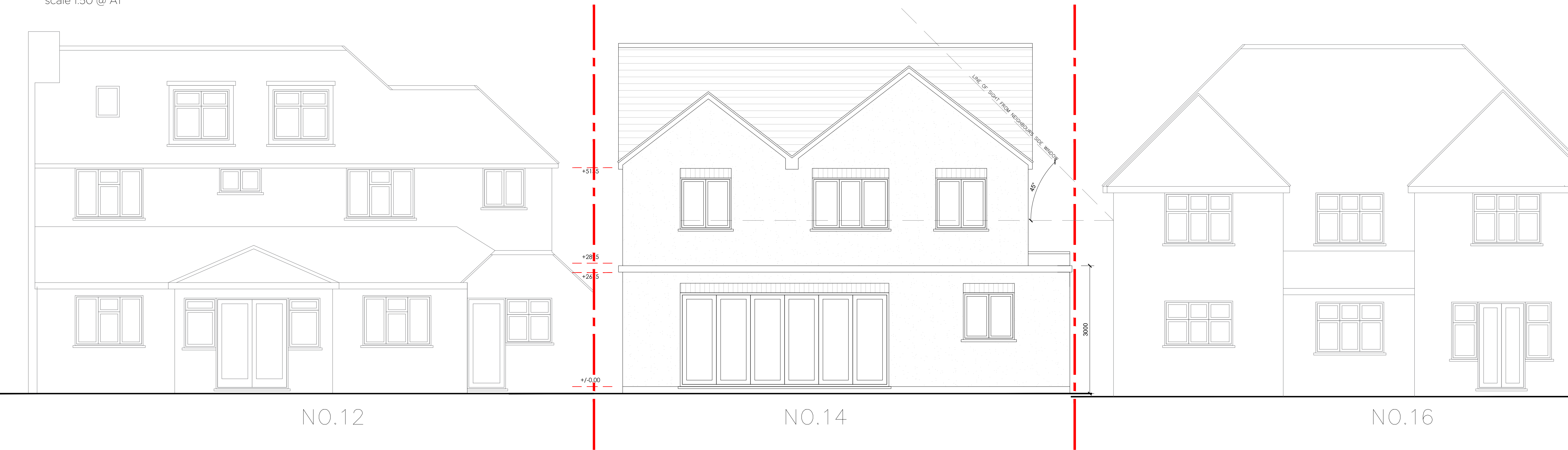
PROPOSED Rear Scene scale 1:50 @ A1