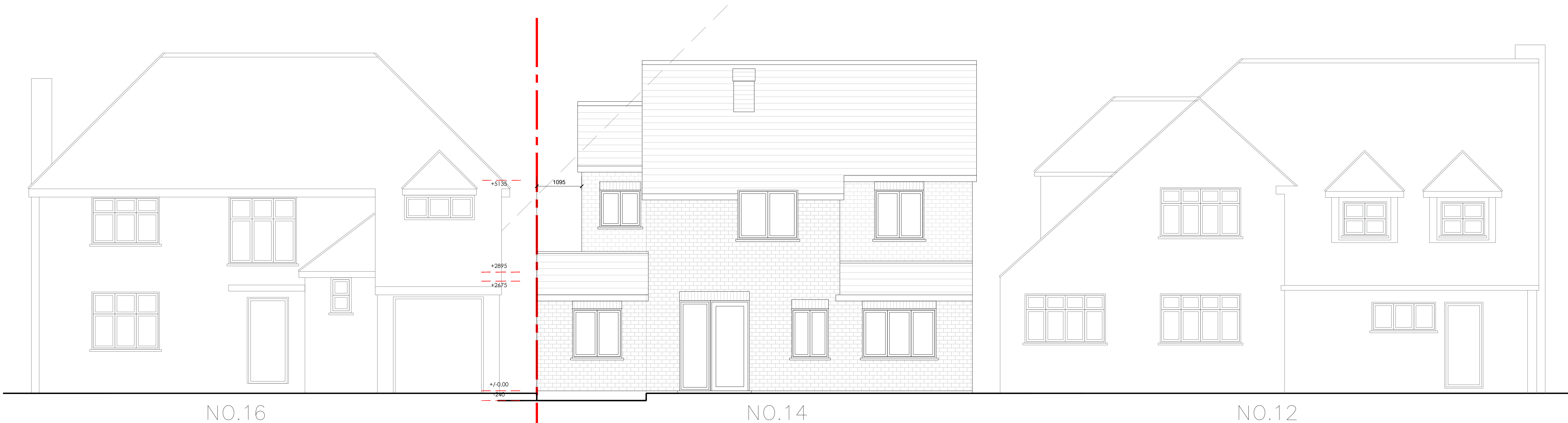
PROPOSED Front Street Scene scale 1:50 @ A1