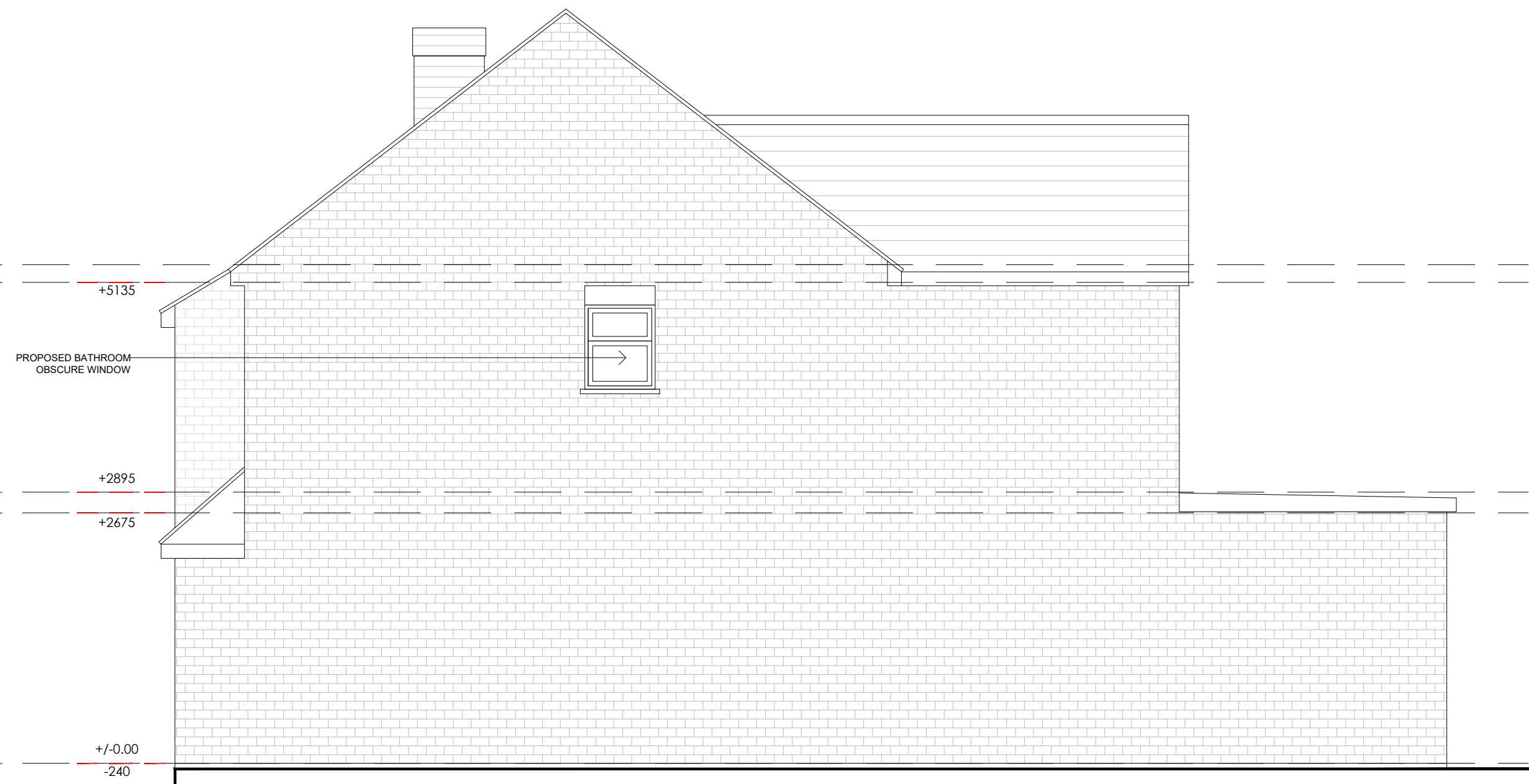
PROPOSED Right Flank Elevation scale 1:50 @ A1