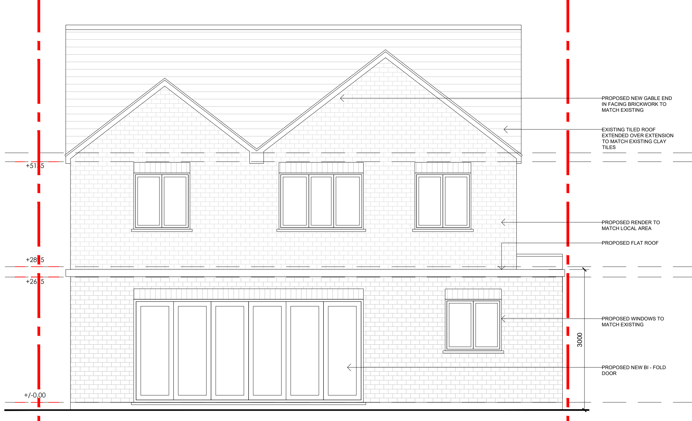
PROPOSED Rear Elevation scale 1:50 @ A1