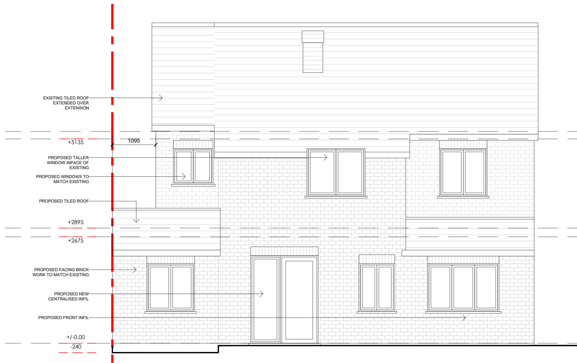
PROPOSED Front Elevation scale 1:50 @ A1