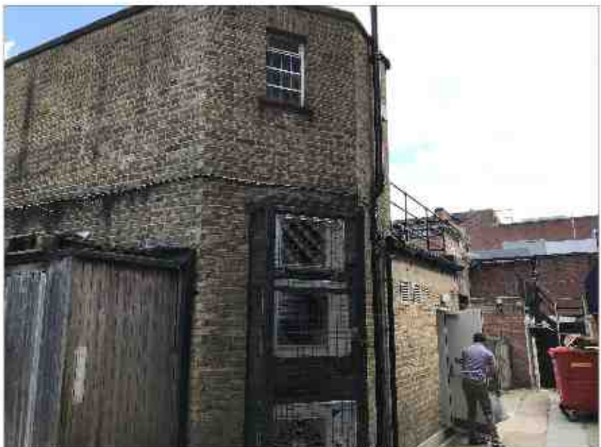
Existing Rear building Photos