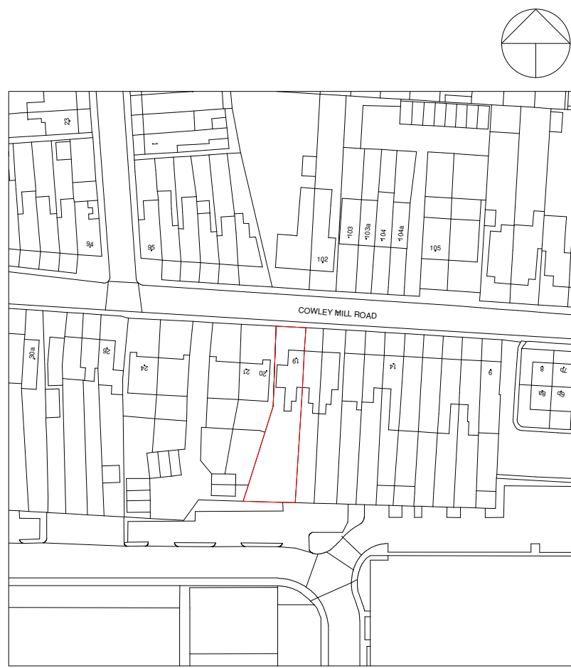
Location Plan 1 : 1250