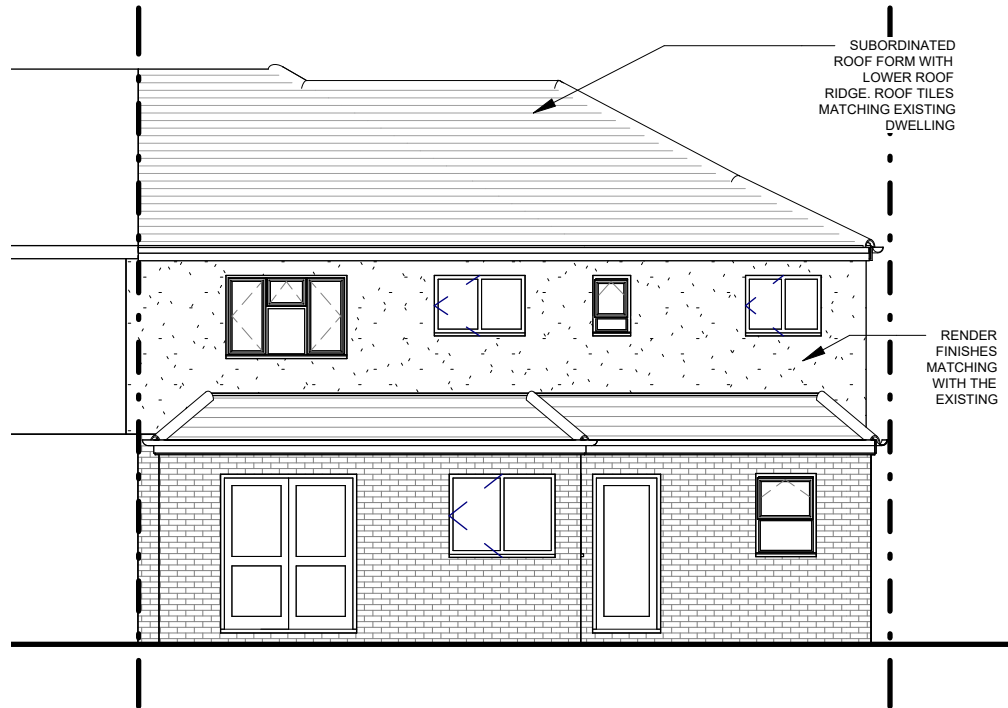
3 PROPOSED NORTH ELEVATION.