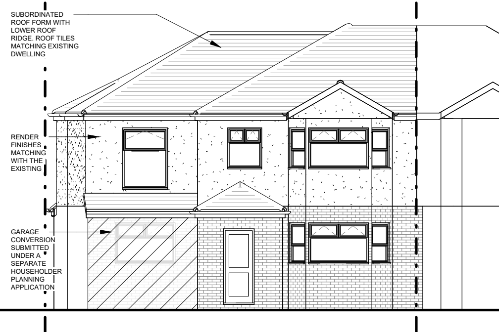
1 PROPOSED SOUTH ELEVATION.