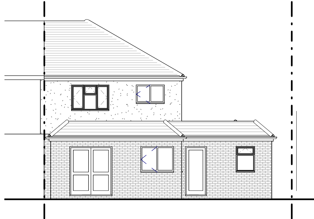
3 EXISTING NORTH ELEVATION