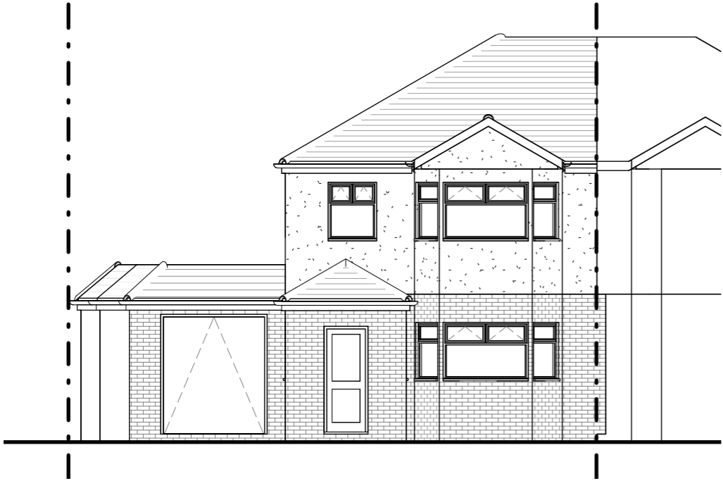
2 EXISTING SOUTH ELEVATION