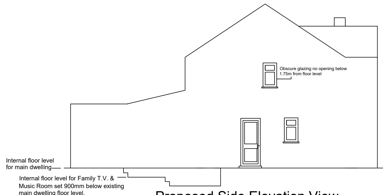
Proposed Side Elevation View From No.16