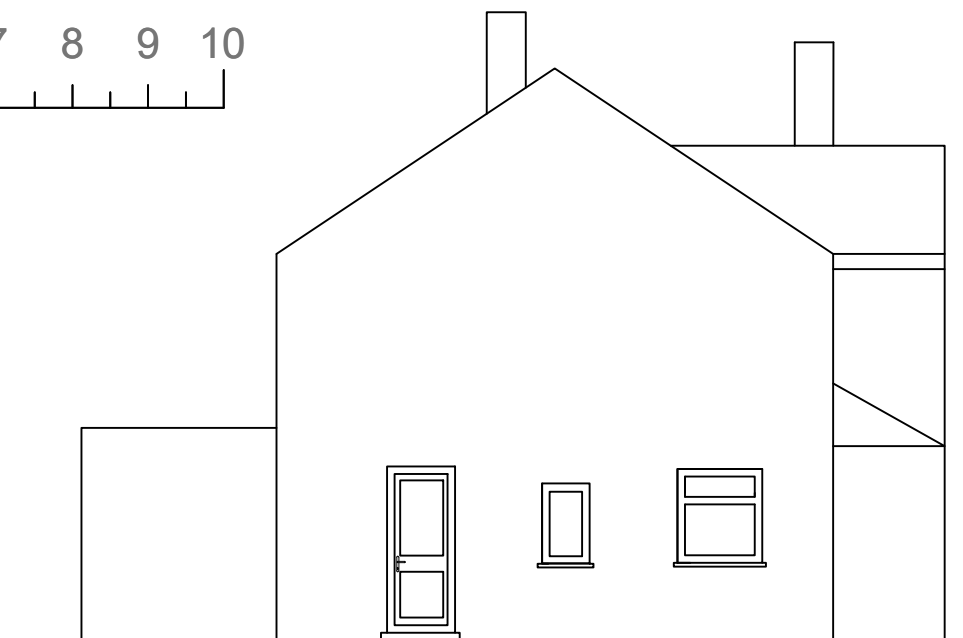
Existing Side Elevation View From No.16