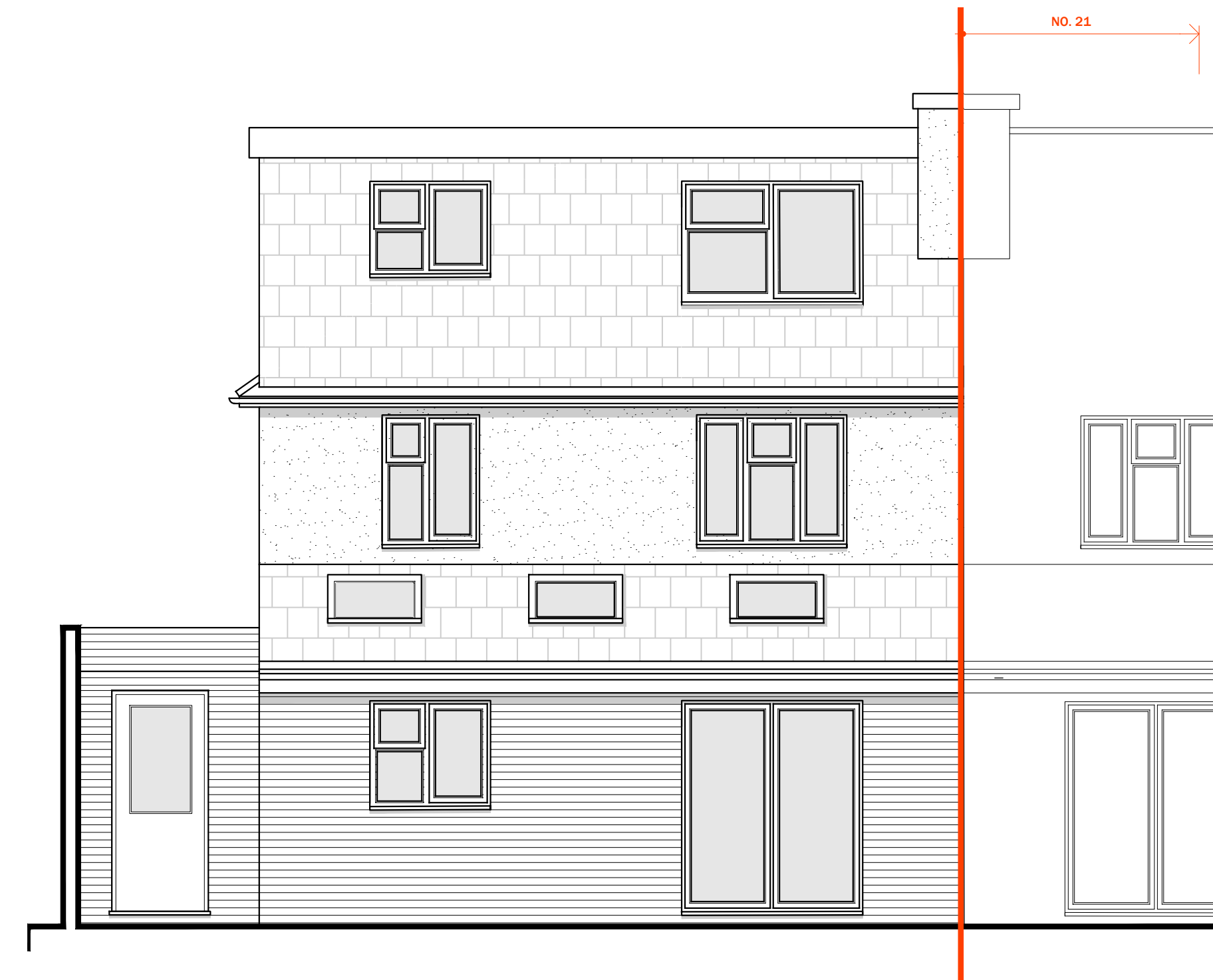
4 REAR ELEVATION SCALE 1:50