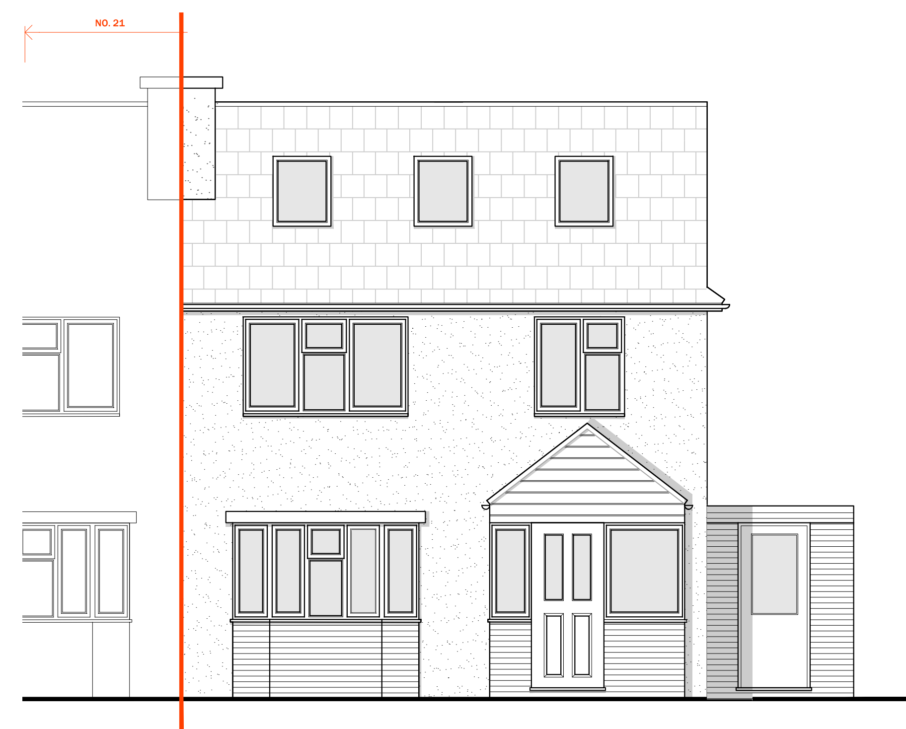
1 FRONT ELEVATION SCALE 1:50