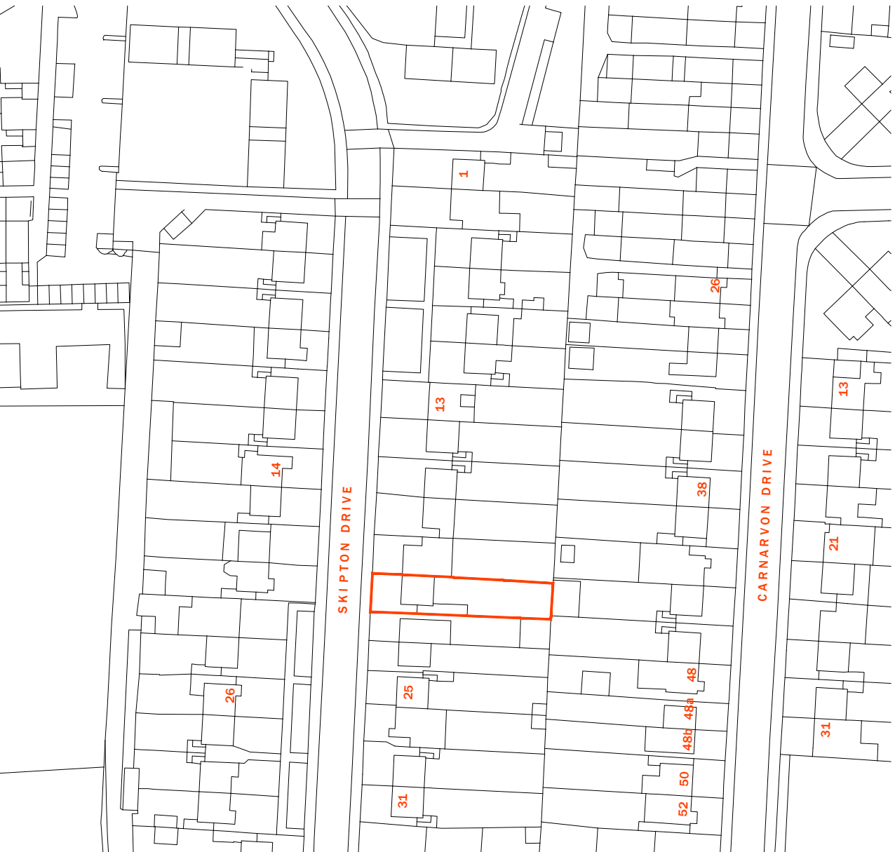
2 LOCATION PLAN SCALE 1:1250