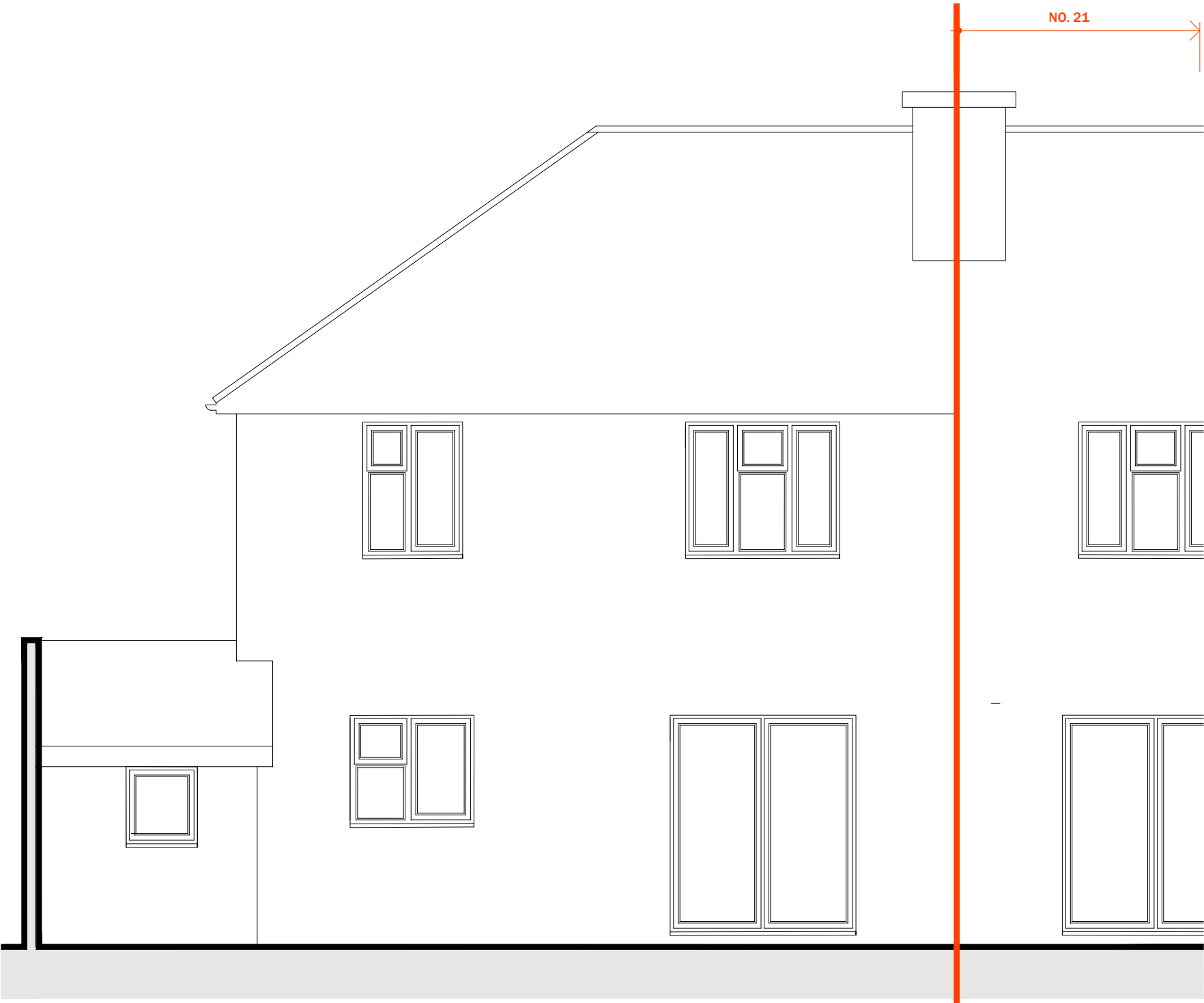
4 REAR ELEVATION SCALE 1:50