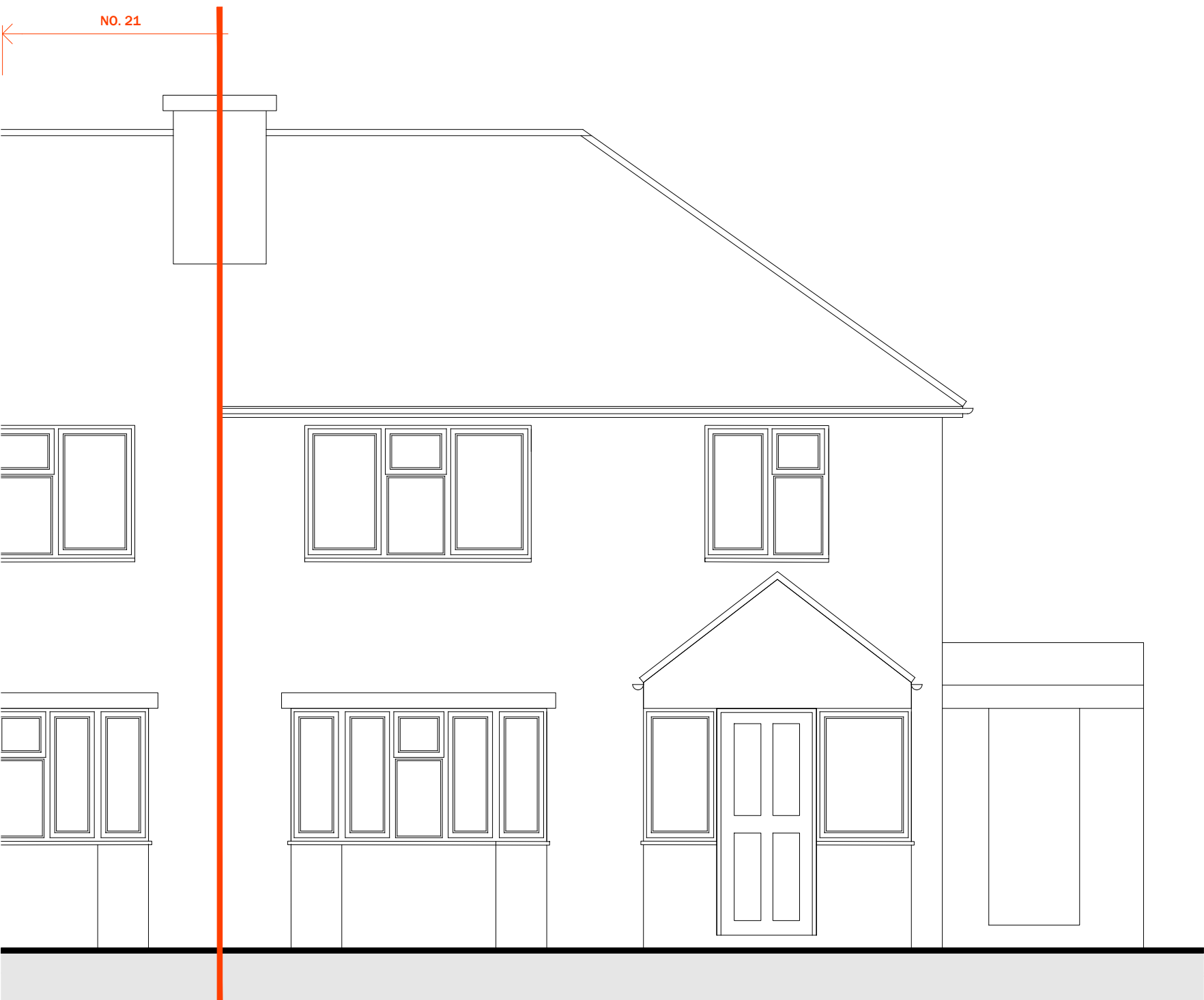
1 FRONT ELEVATION SCALE 1:50