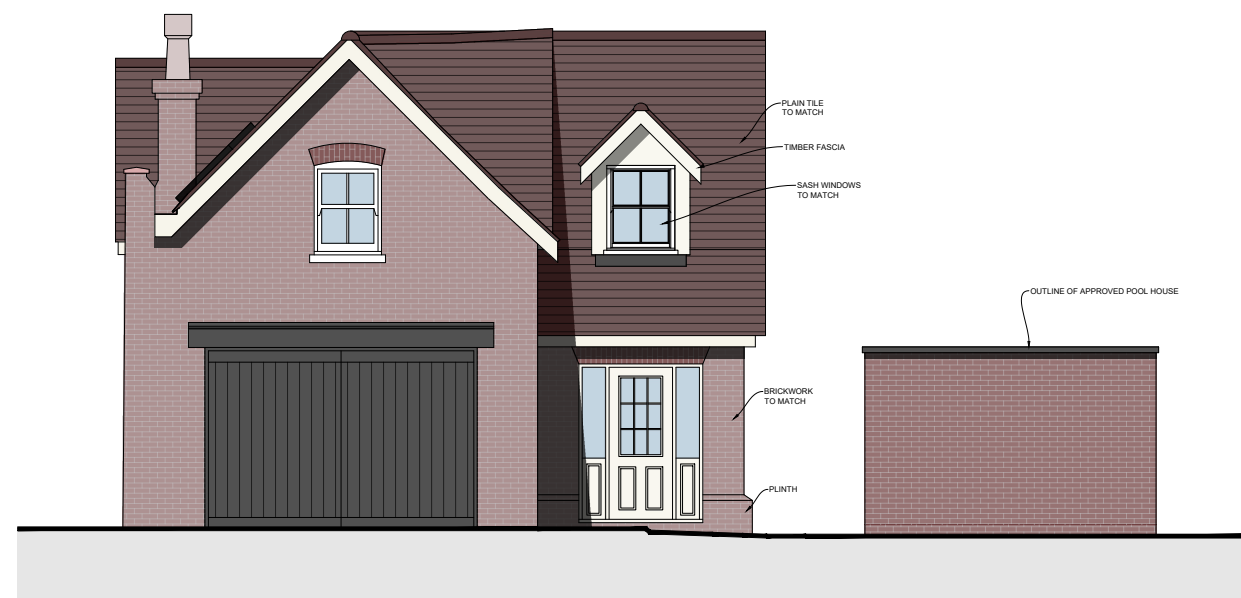
APPROVED FRONT ELEVATION - WITH APPROVED OUTBUILDING SHOWN