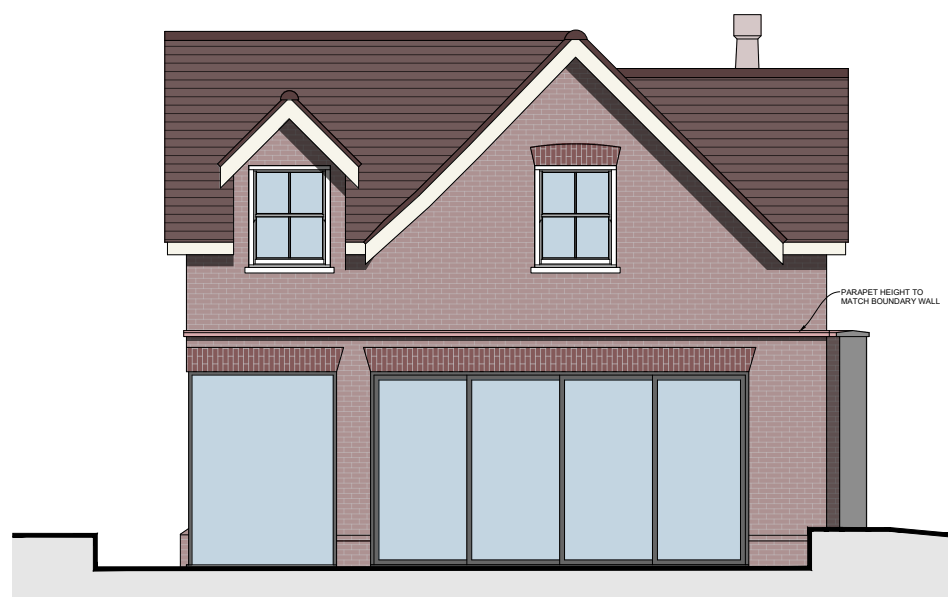
APPROVED REAR ELEVATION