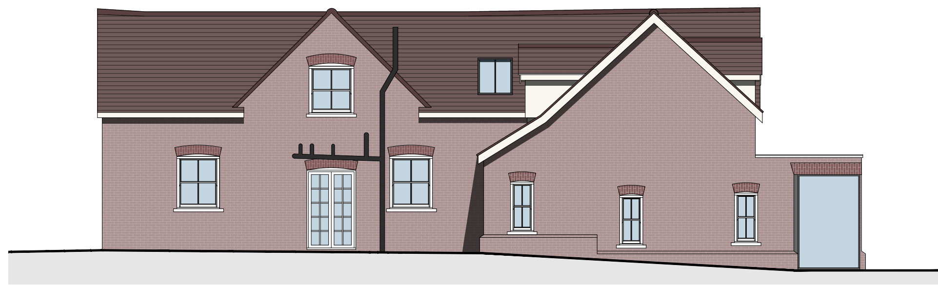
APPROVED SIDE ELEVATION