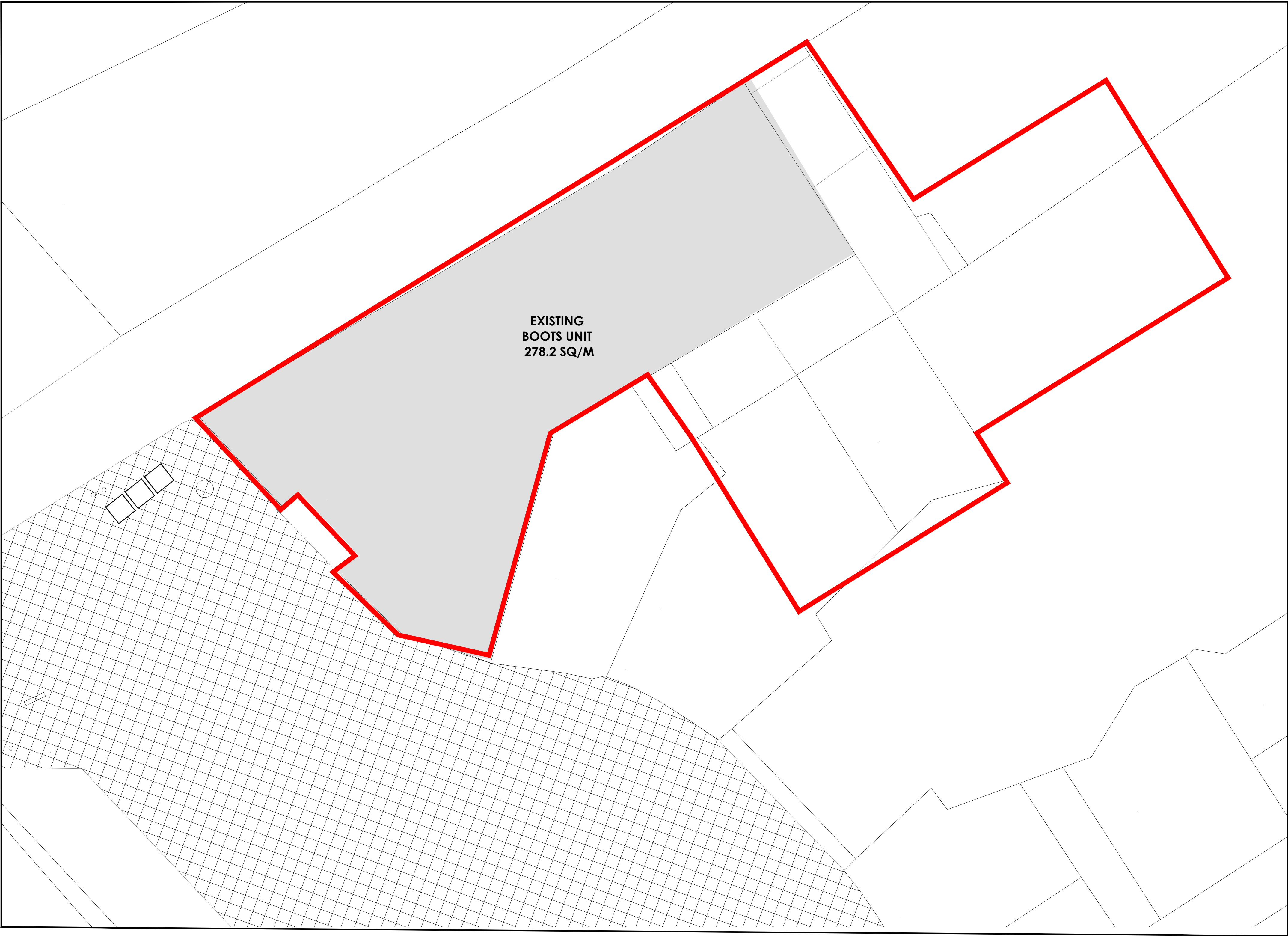
EXISTING SITE PLAN SCALE 1:100

PROPOSED SITE AREA (EXCLUDING ACCESS & EGRESS) 5325.9 SQFT 494.8 SQM EXISTING SITE AREA DEMISE