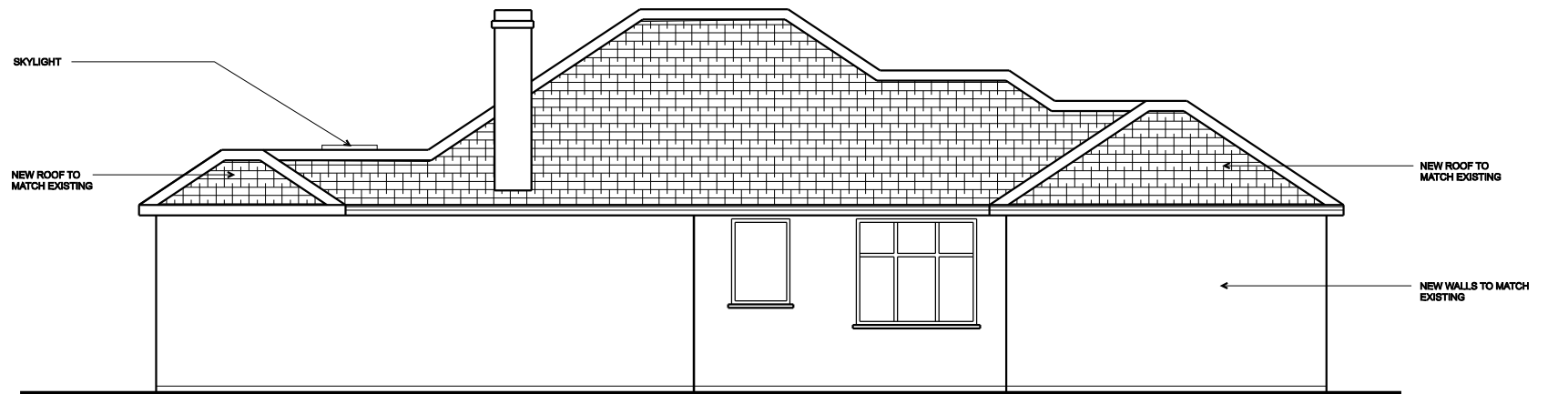
GARAGE SIDE ELEVATION