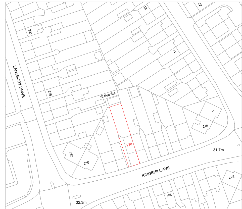
Location Plan @ Scale 1:1250

Proposed Development: Conversion of Single Story Rear Conservatory to Single Story Rear Extension