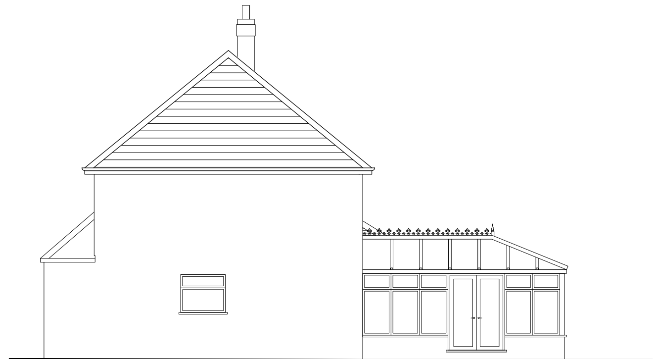
EXISTING SIDE (NORTH-EAST) ELEVATION