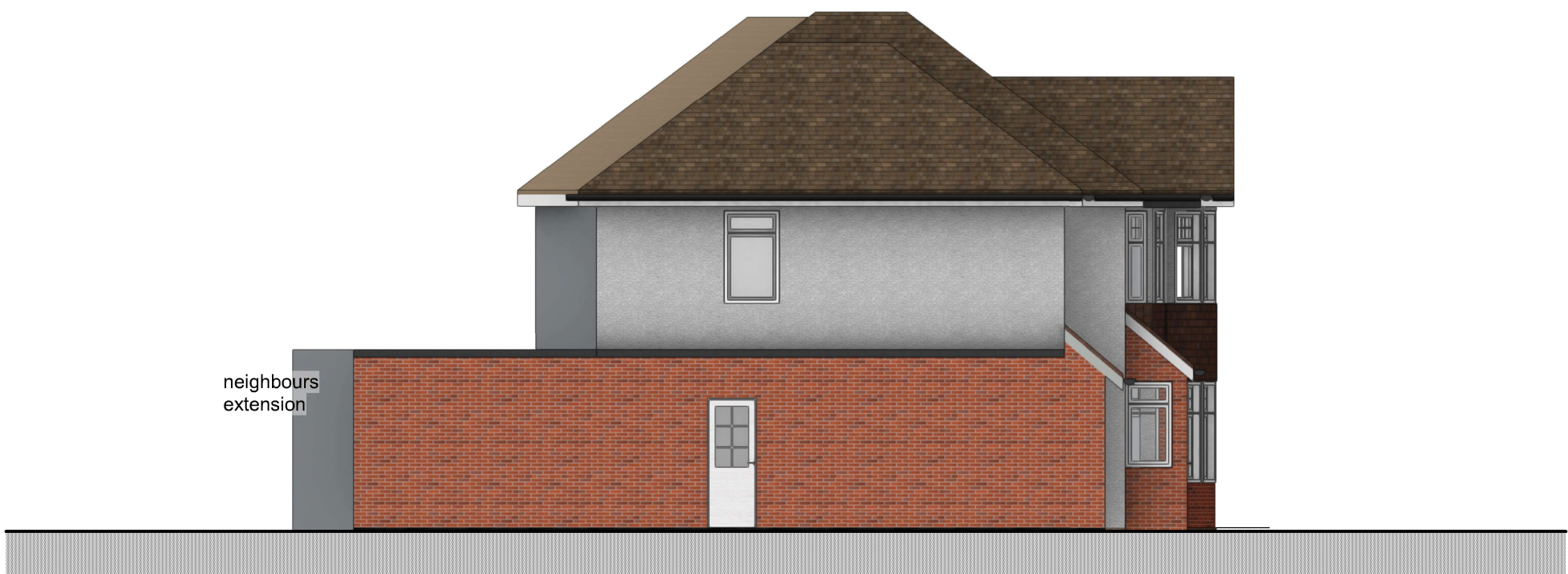
2 02 PROP ELEV SIDE Scale: 1:100