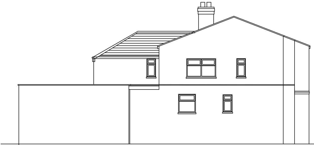
Proposed Side Elevation Scale 1:100@A3

Do not scale from this drawing. The Contractor should check all dimensions on site prior to commencement of any work and contact the Designer should discrepancies arise.