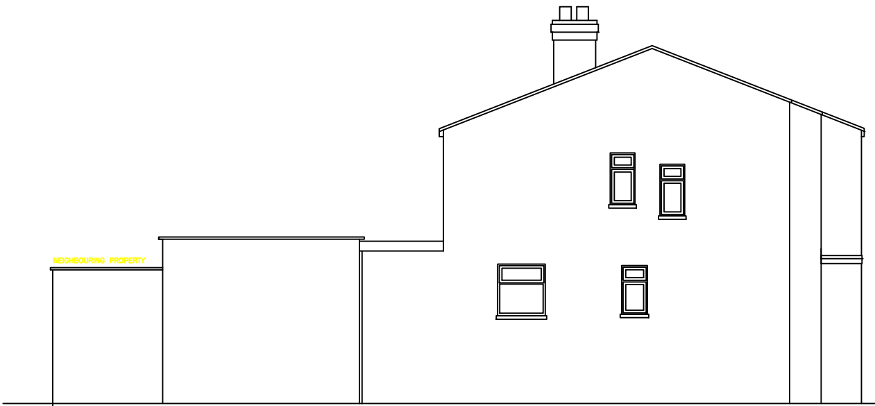
Existing Side Elevation Scale 1:100@A3