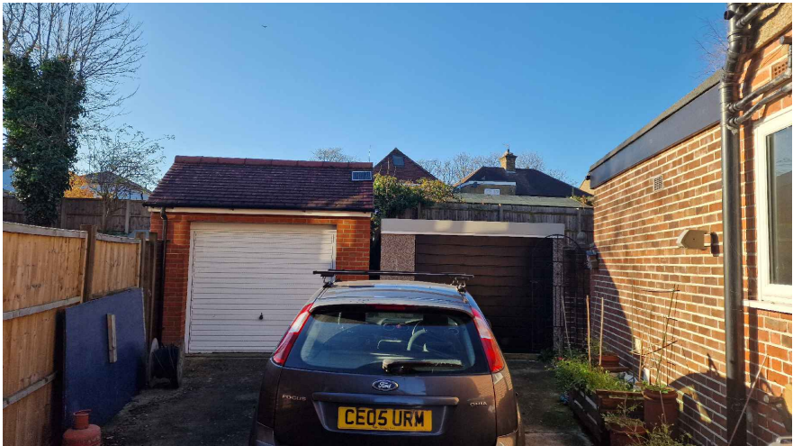
Front Elevation of Garages - Garage to 21 Southfield Close On Right