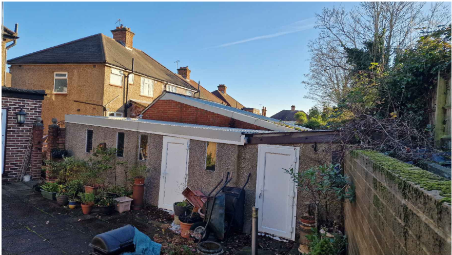
Side Elevation of Existing Garage to 21 Southfield Close Showing Secondary Retaining Wall