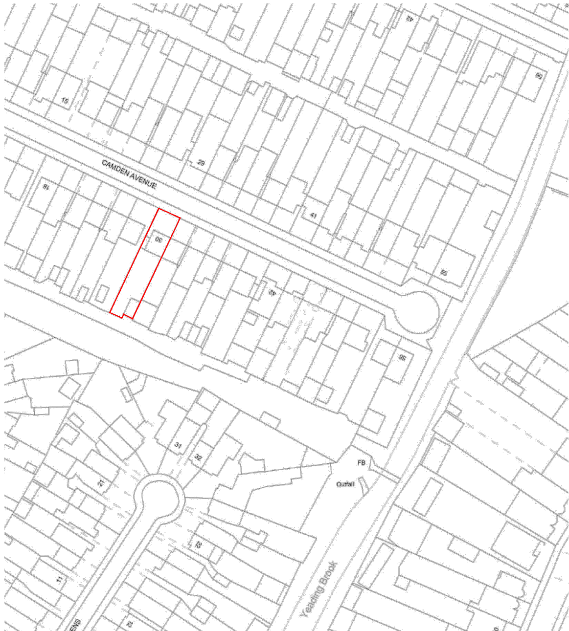
01 - OS MAP SCALE 1:1250