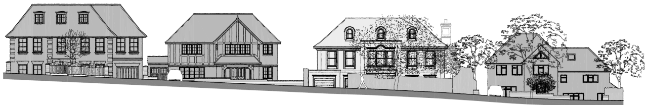
Fig. 3 – Proposed street scene when viewed from Copse Wood Way.

In conclusion, it is considered that the scale and form of the new house is acceptable, and is in keeping with other houses within the immediate vicinity and the character of the area generally.