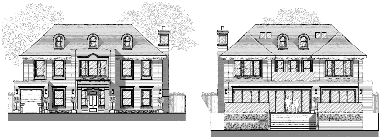
Fig. 1 – Proposed front elevation of 61 Copse Wood Way, Northwood.

Planning approval is sought for the demolition and replacement of the existing detached two storey dwelling, with 1no detached dwelling with use of roof space, together with the retention of the existing access points and associated ancillary works.