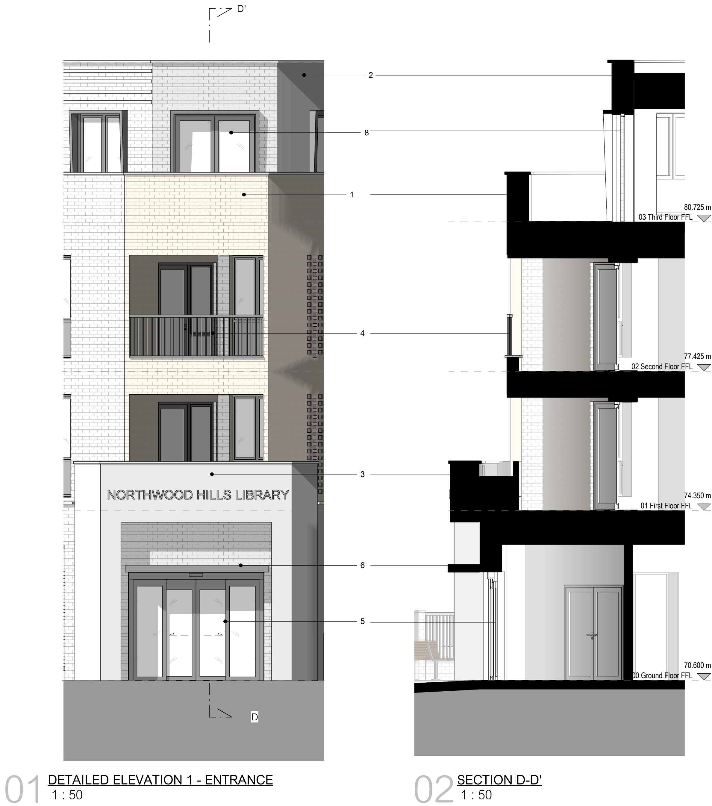
01 DETAILED ELEVATION 1 - ENTRANCE 1 : 50