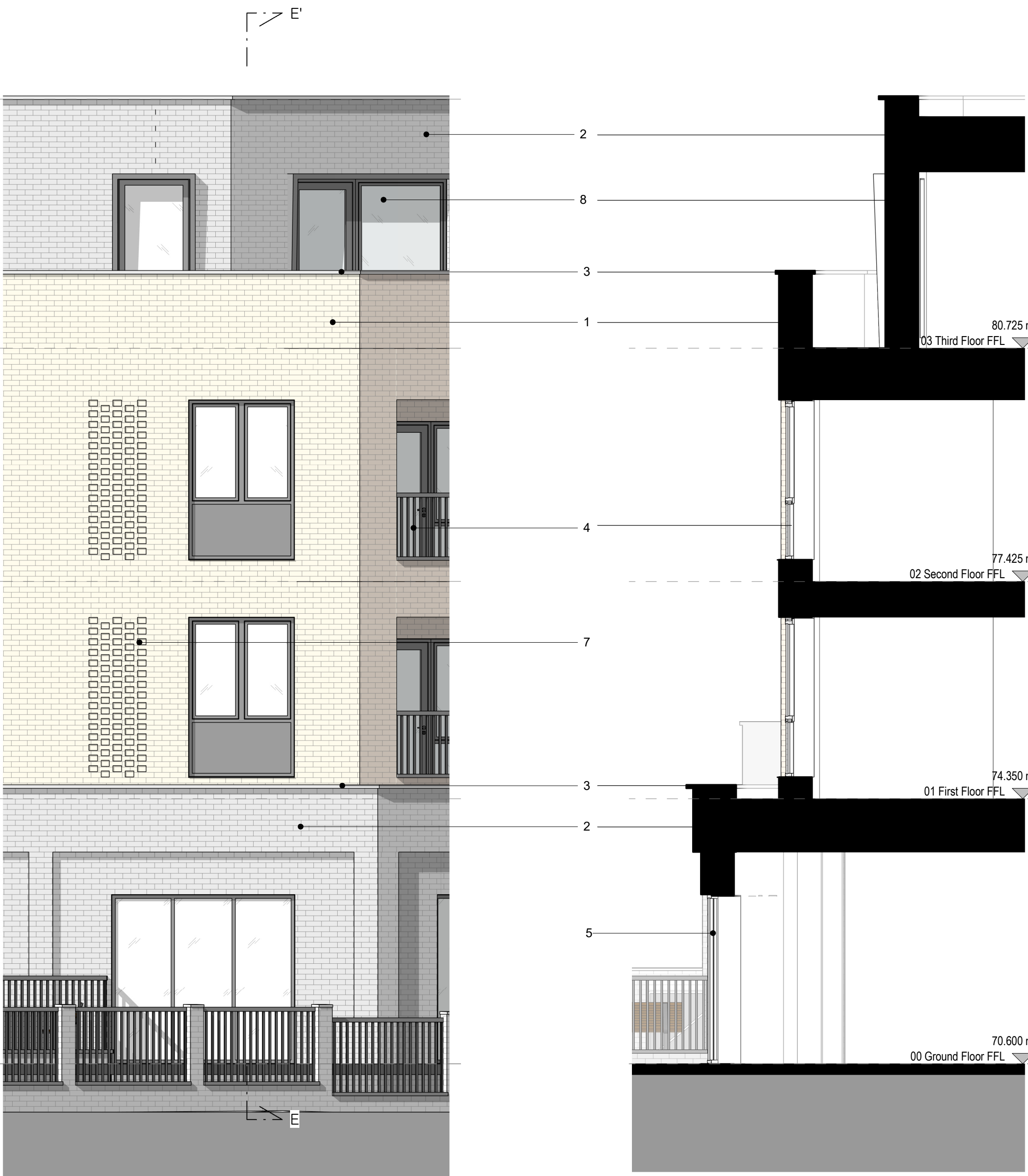
03 DETAILED ELEVATION 2 - PINNER ROAD 1 : 50