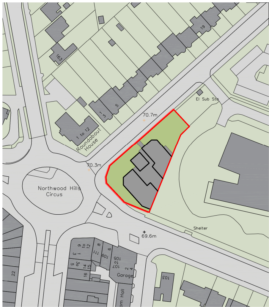
05 Location Plan 1 : 1250