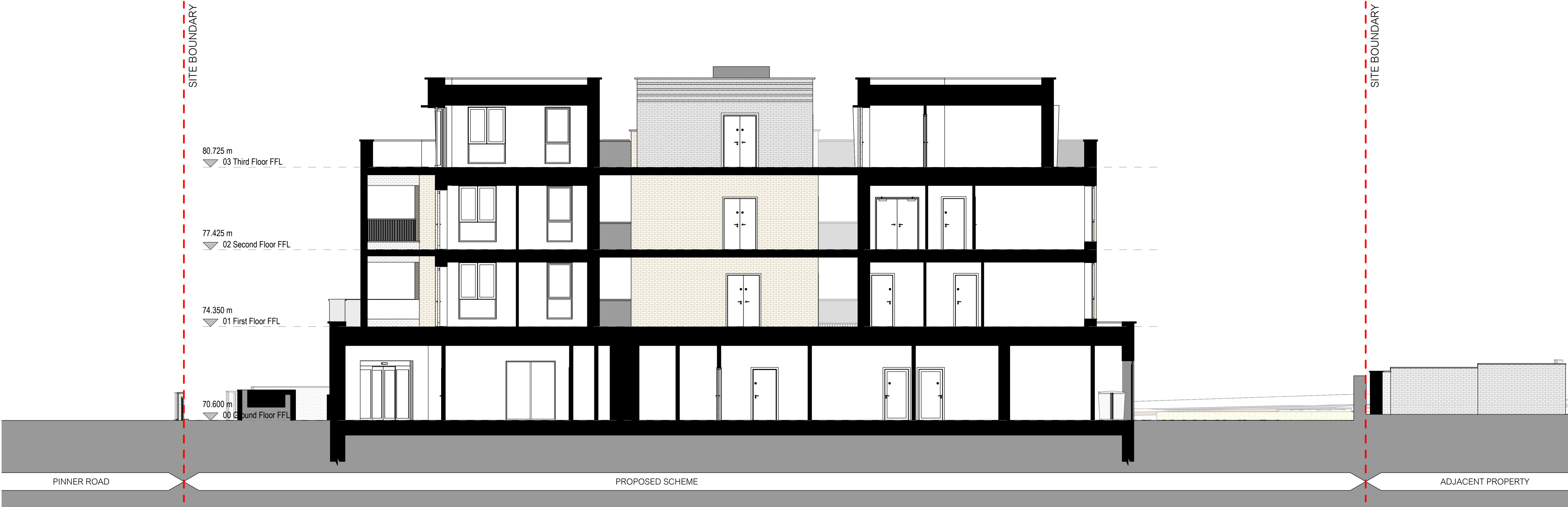
02 Proposed Section D-D' 1 : 100