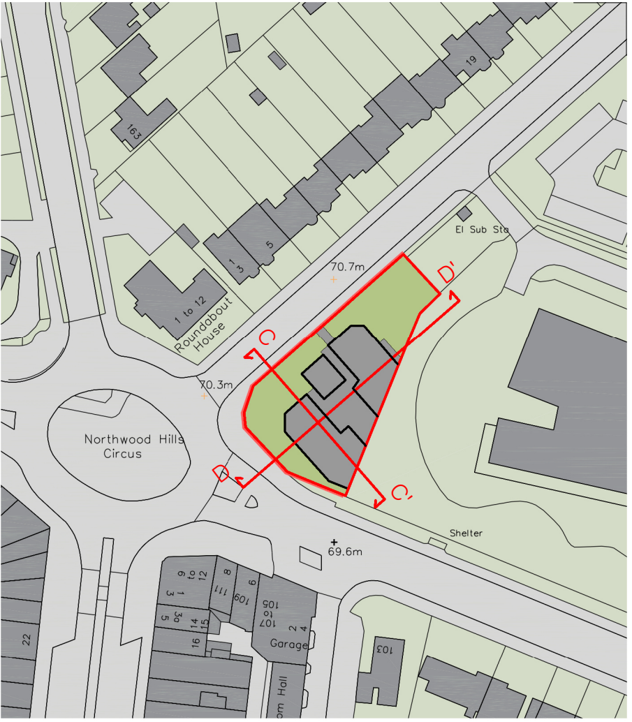
03 Location Plan 1 : 1250