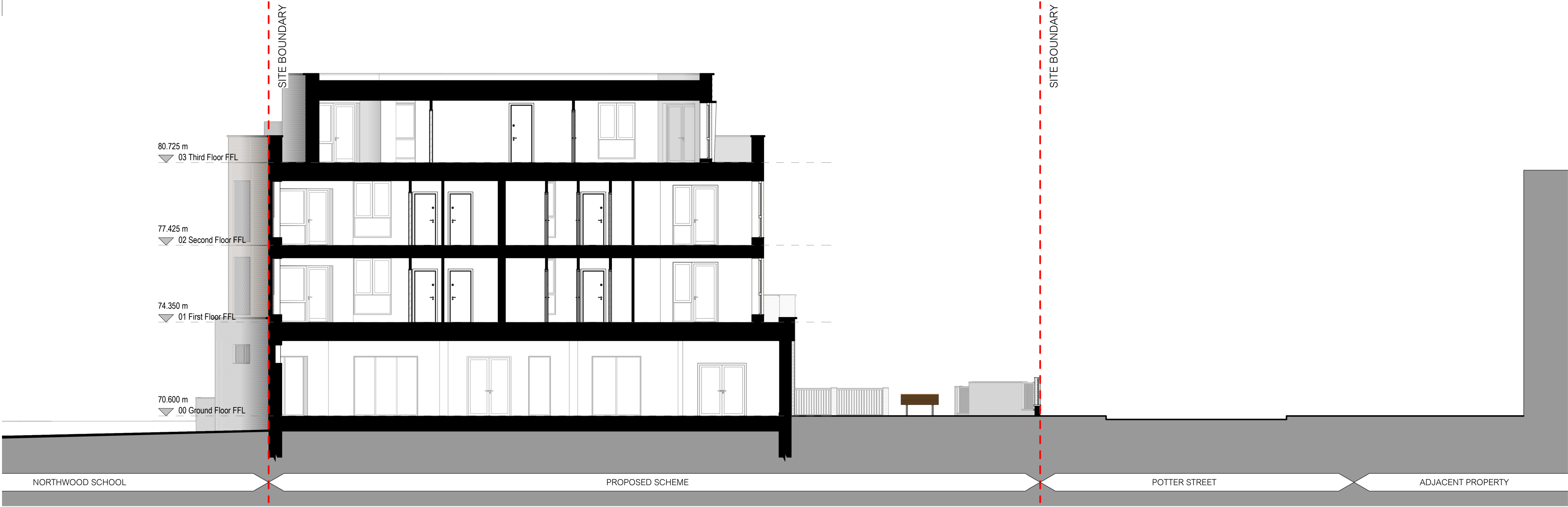
01 Proposed Section C-C' 1 : 100