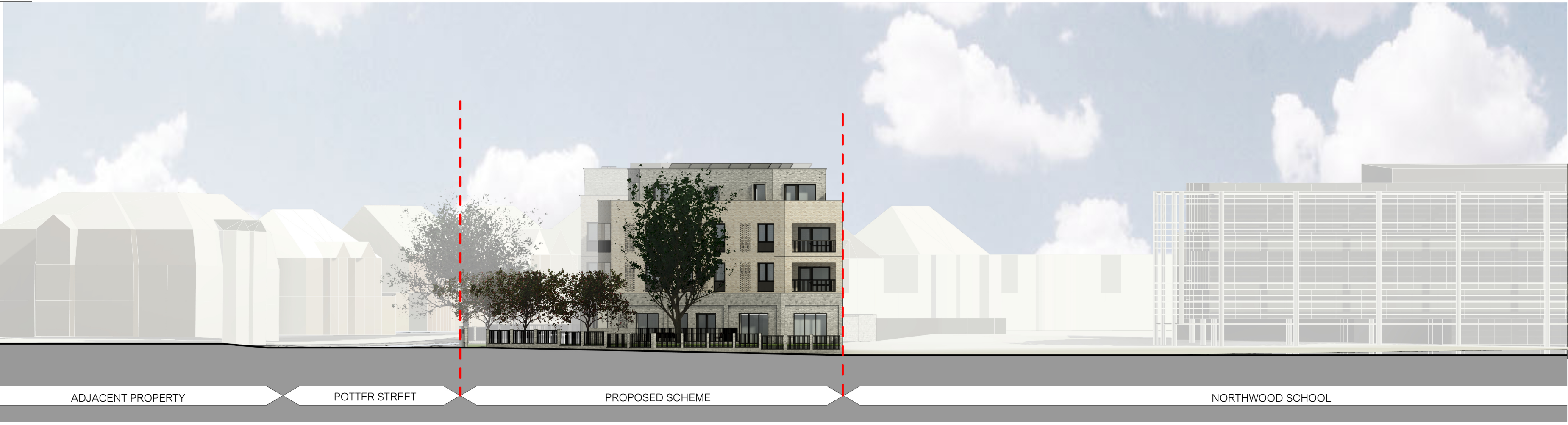
01 Proposed Pinner Road Elevation 1 : 250