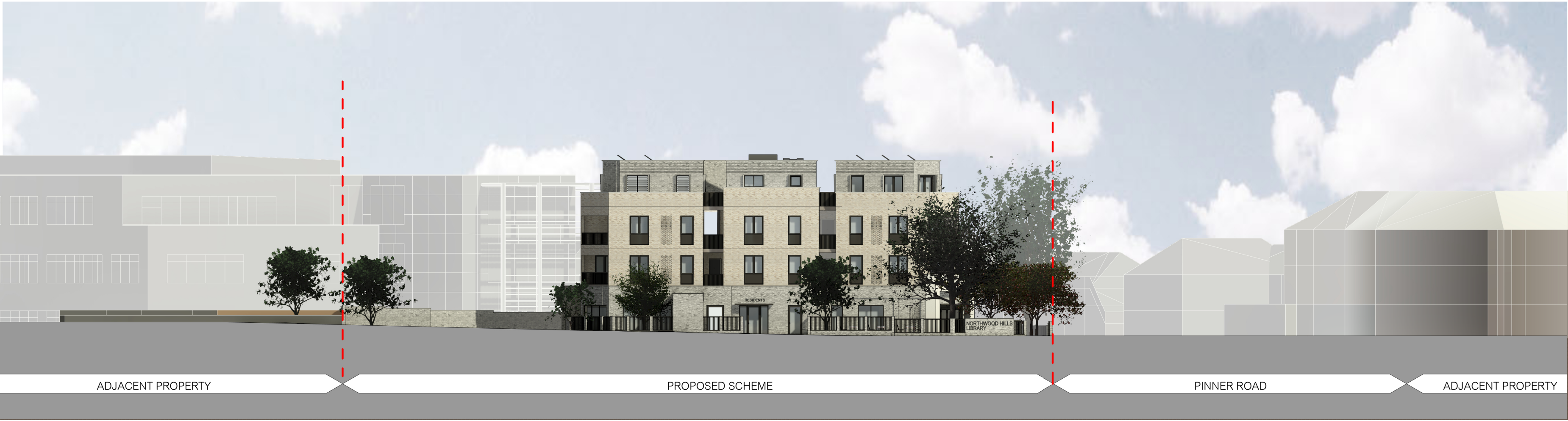
02 Proposed Potter Street elevation 1 : 250