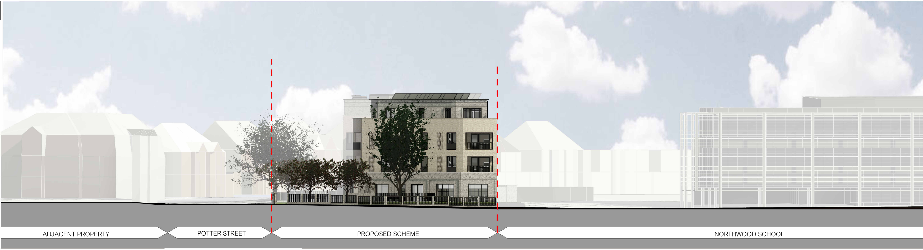
01 Proposed Pinner Road Elevation 1 : 250