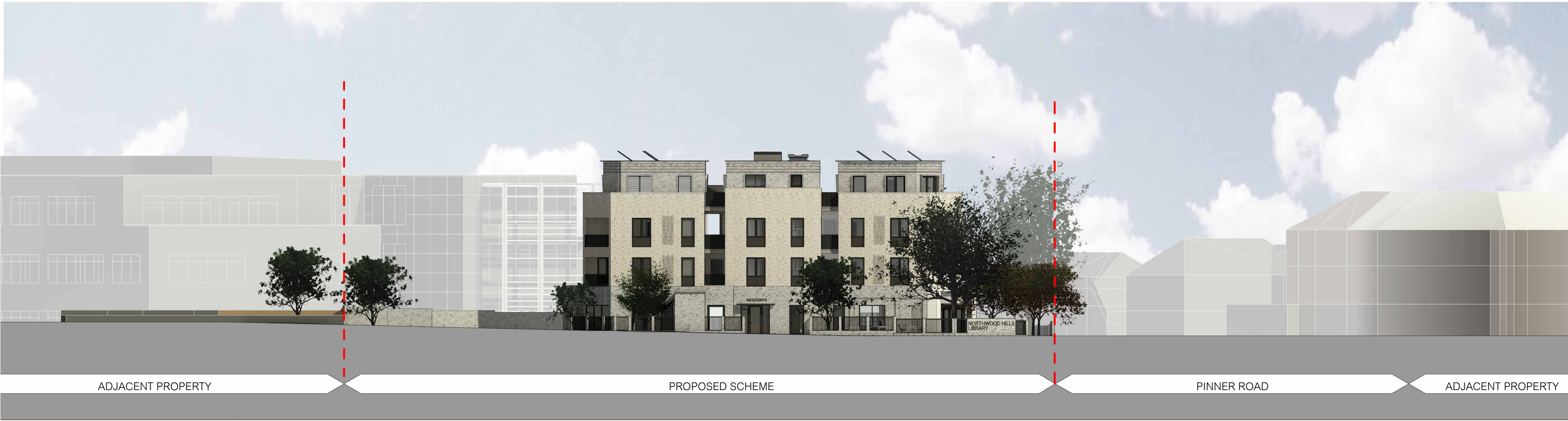
02 Proposed Potter Street elevation 1 : 250