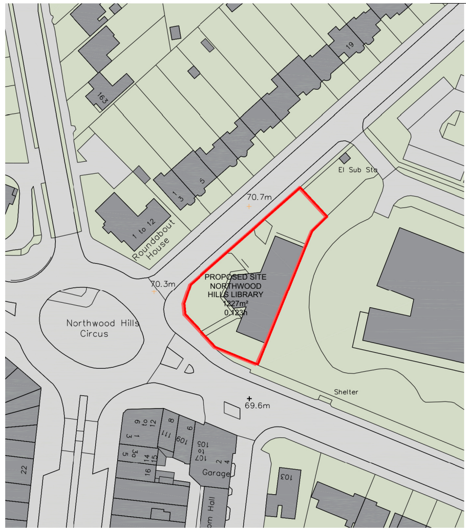
02 Location Plan 1: 1250