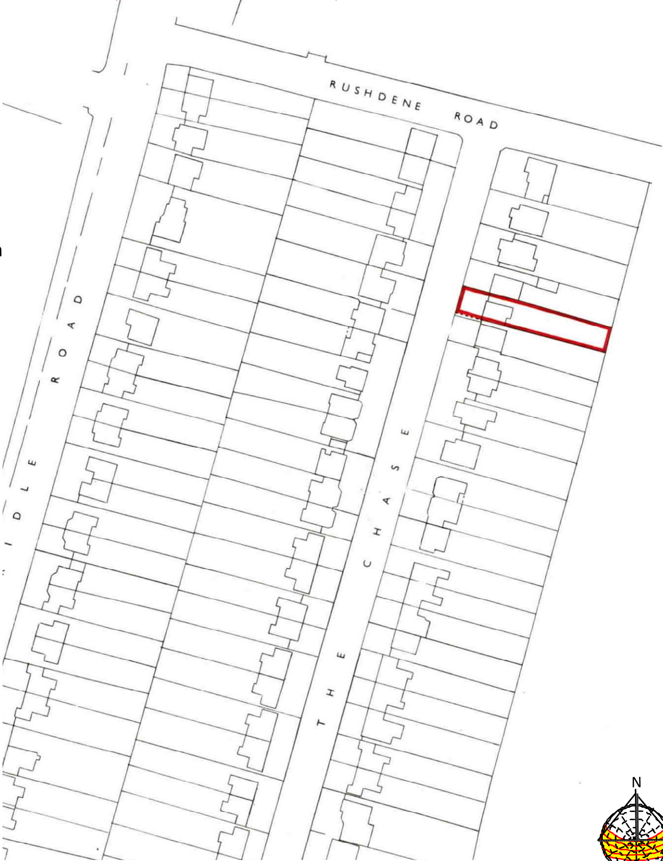
LOCATION PLAN Site boundary shown in red