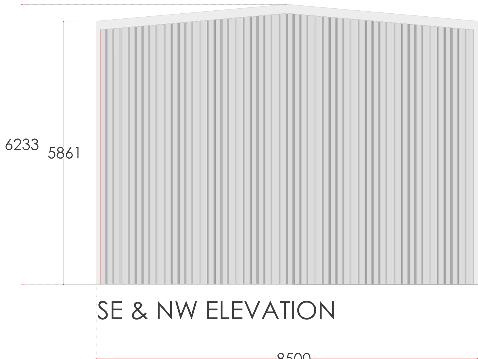
SE & NW ELEVATION