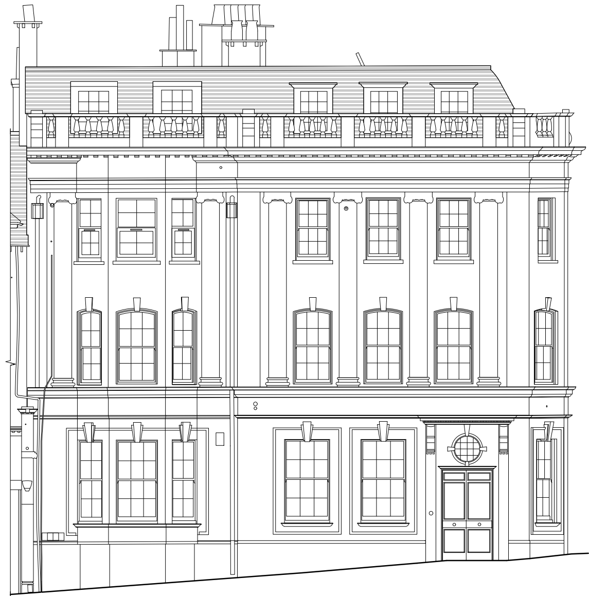
Proposed Elevation 1 (as existing)