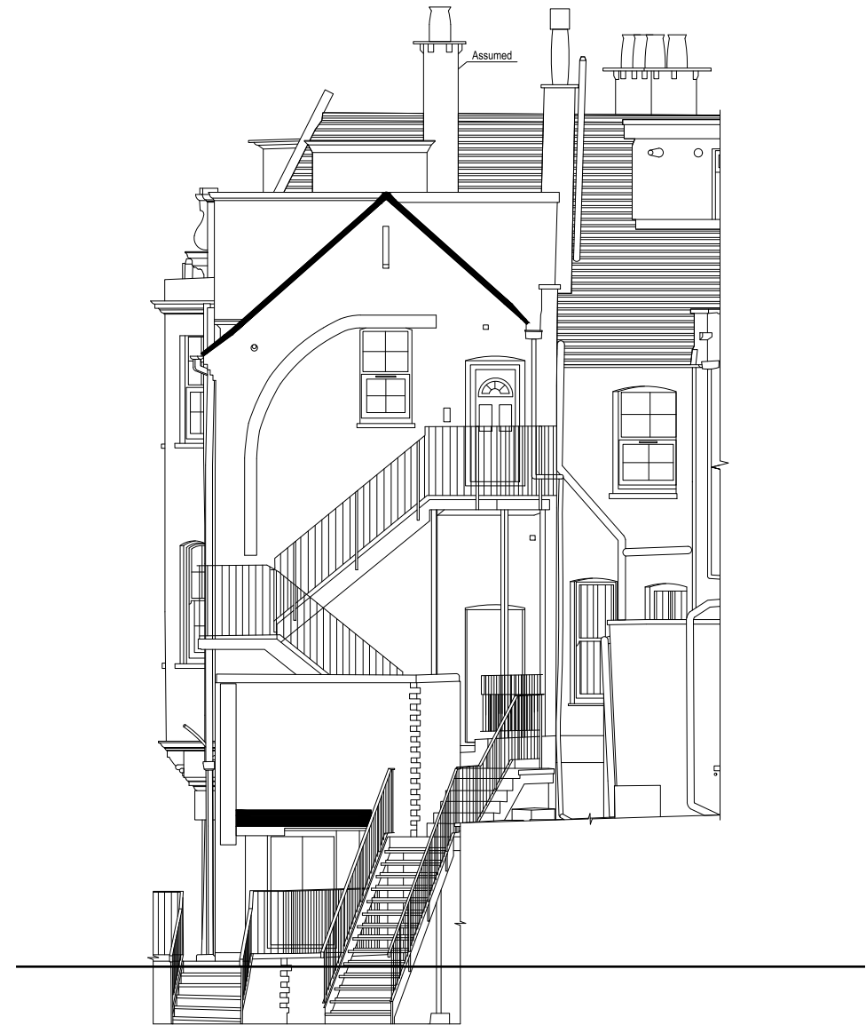
Existing Elevation 5