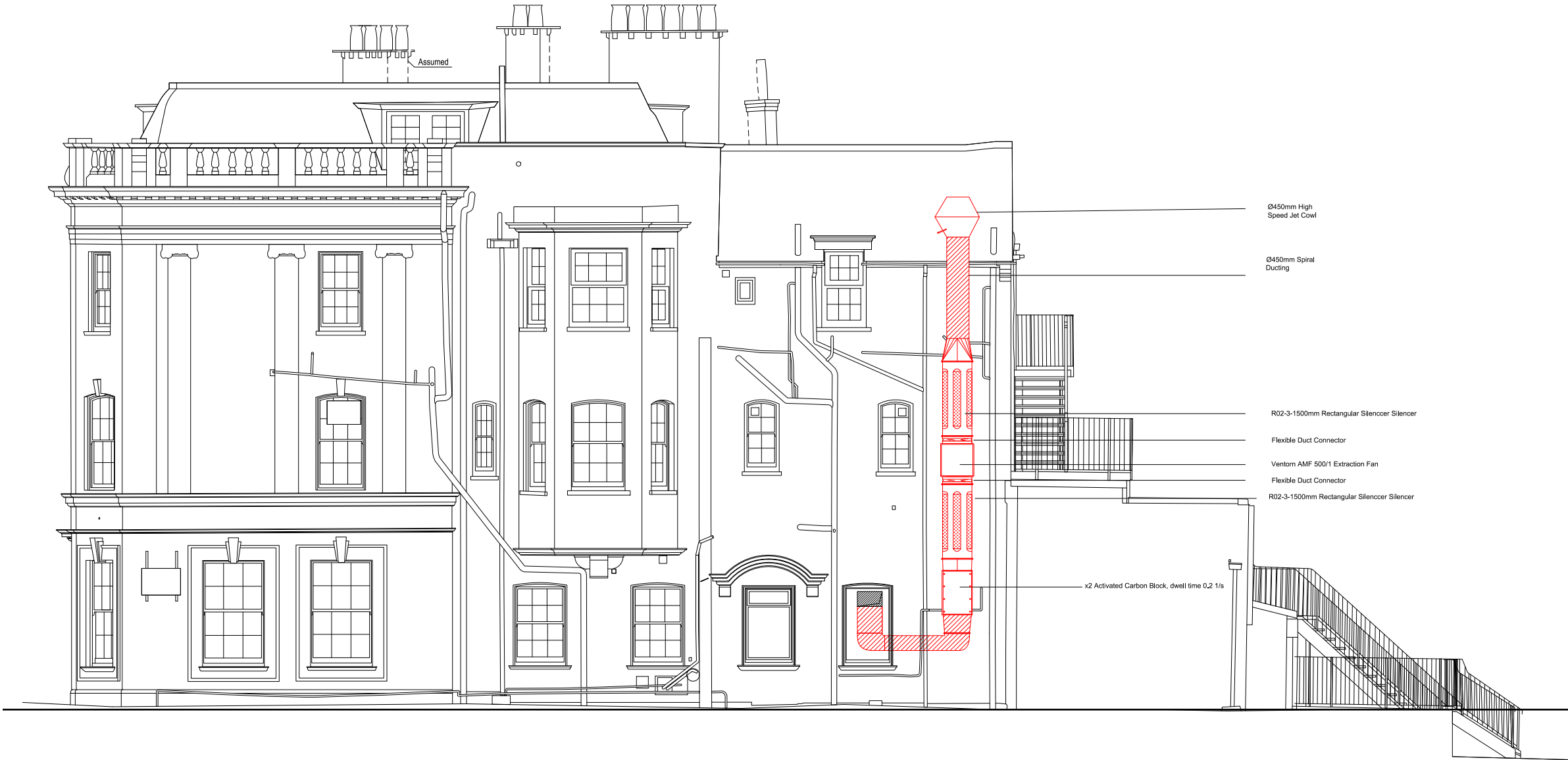
Proposed Elevation 2

63.0: 9dB 125.0: 18dB 250.0: 30dB 500.0: 47dB 1000.0: 50dB 2000.0: 50dB 4000.0: 50dB 8000.0: 40dB