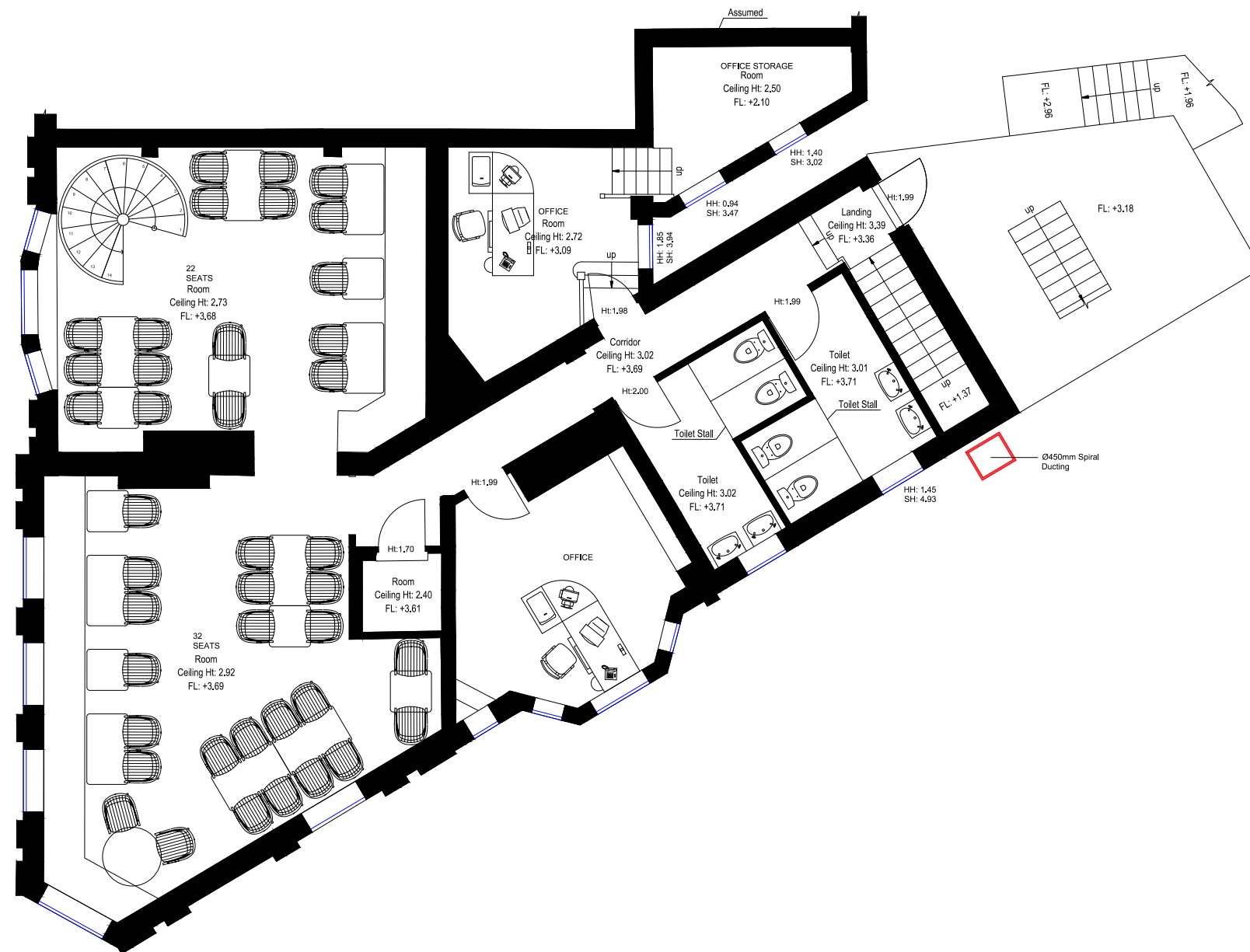
Proposed First Floor Plan

NOTE : EXTRACTION DESIGN TO BE READ IN CONJUNCTION WITH SPECIFICATION DOCUMENT