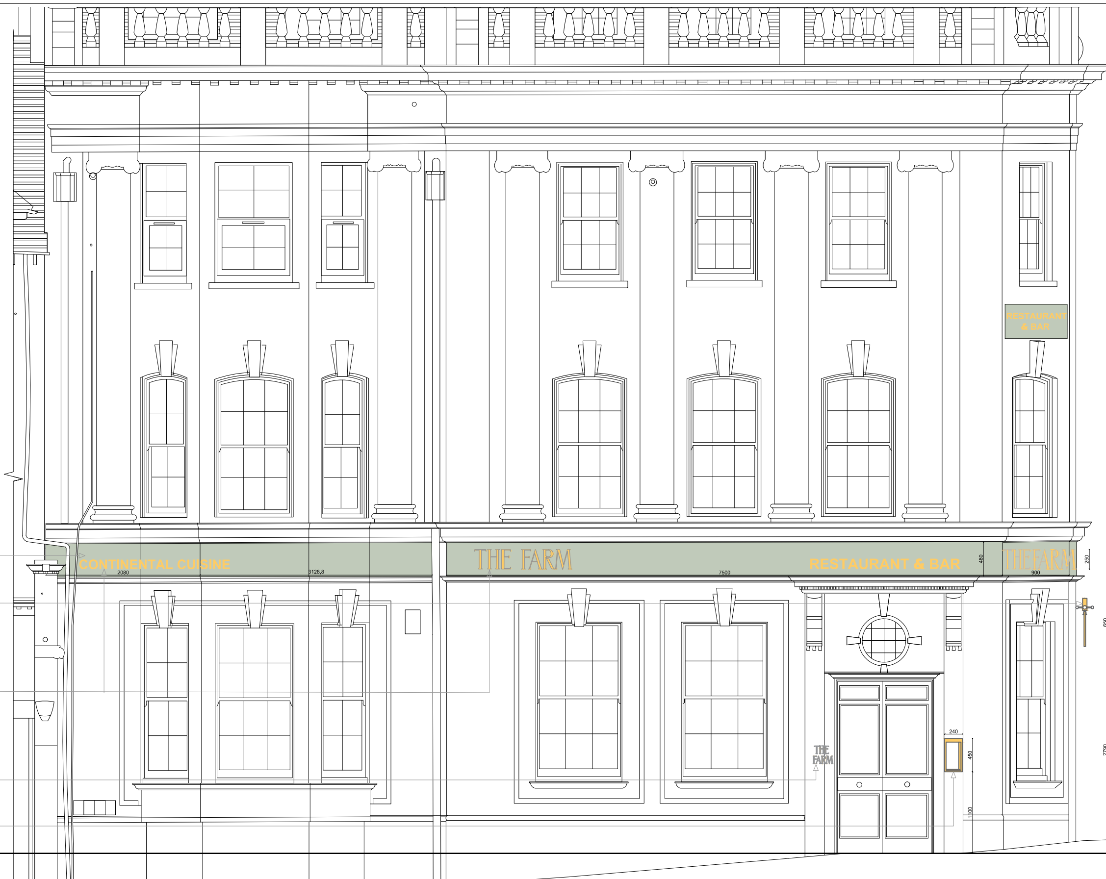
Proposed Elevation 1 (as existing)

Proposed Menu box internally illuminated