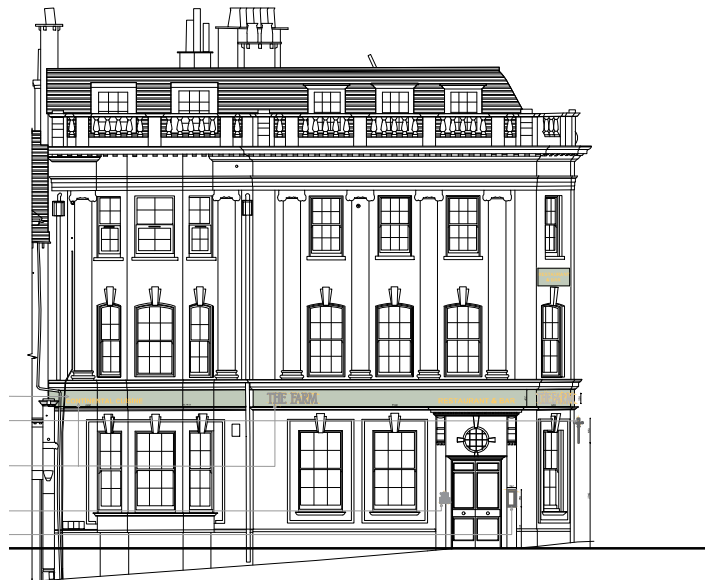
Proposed Elevation 1 (as existing)

Aluminium Composit Panel 100mm , sage green H-600mm to be retained