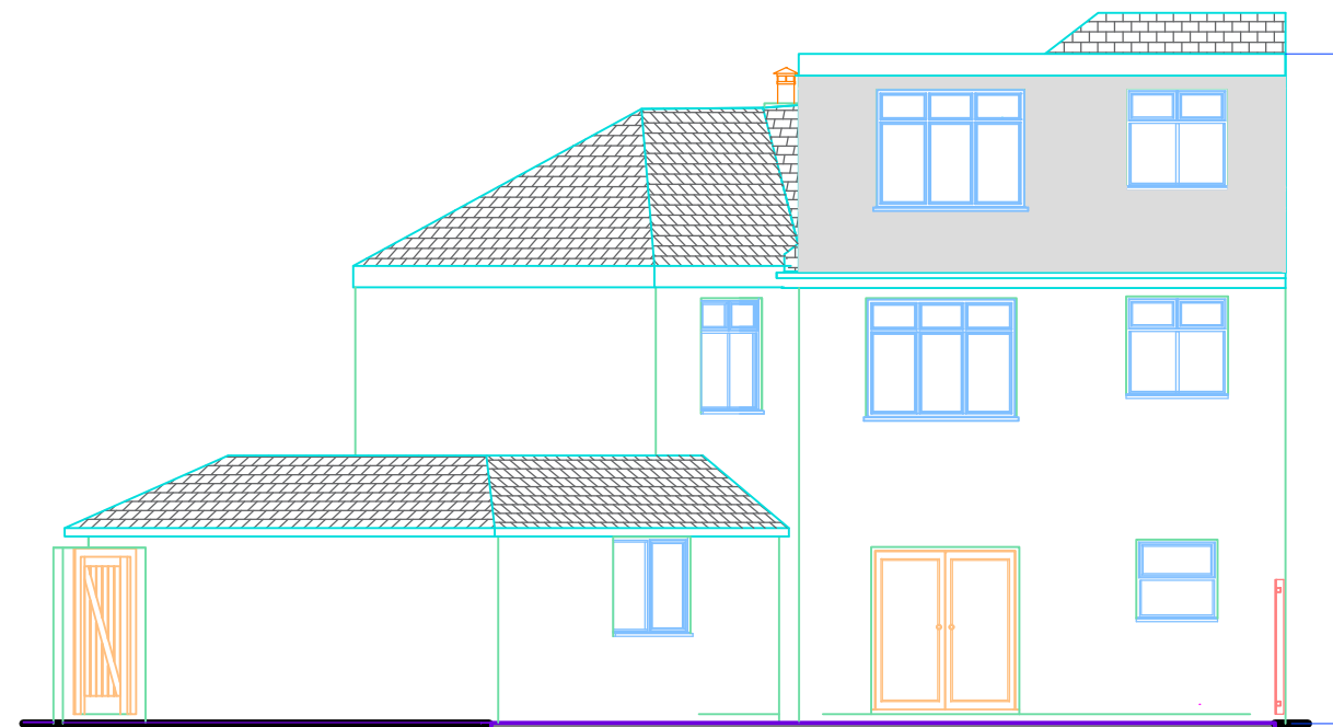
2 PROPOSED REAR ELEVATION A106 SCALE: 1:100