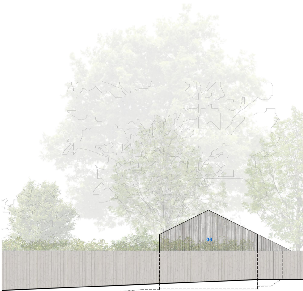
04 PROPOSED WEST ELEVATION 1:100