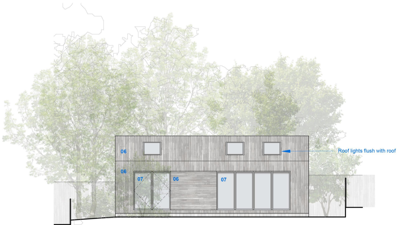
03 PROPOSED NORTH ELEVATION 1:100