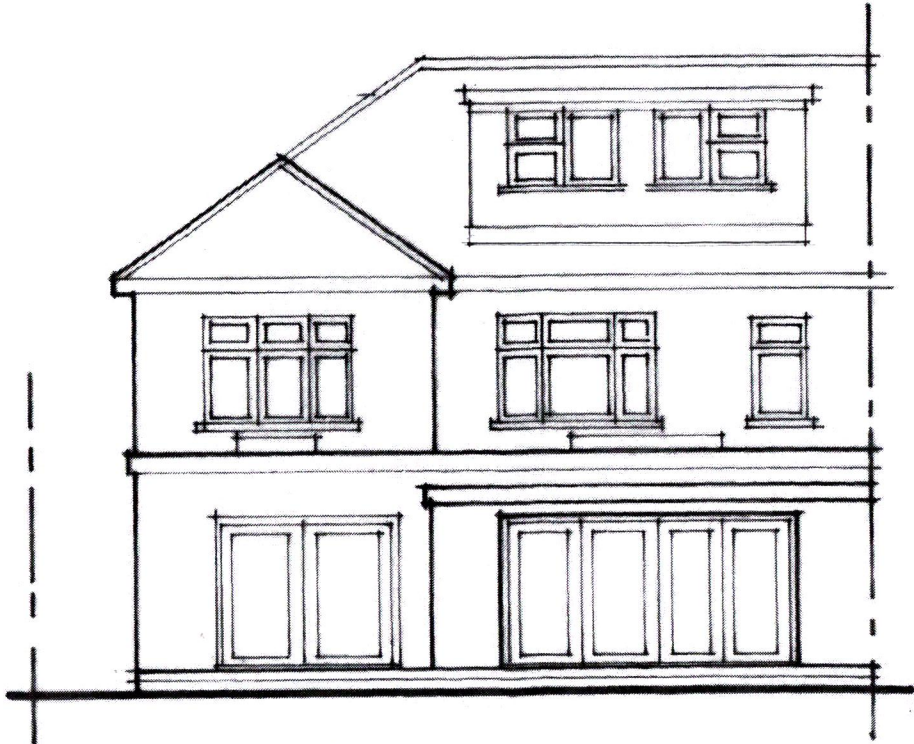
REAR ELEVATION (EAST)