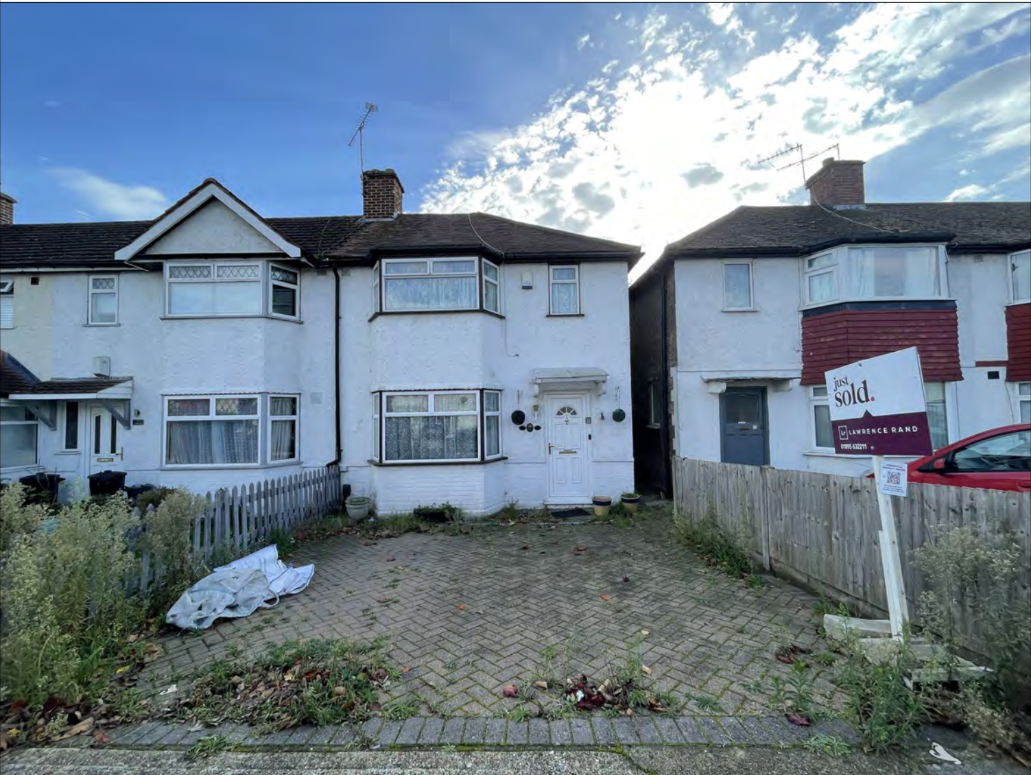
EXISTING FRONT SITE PICTURE