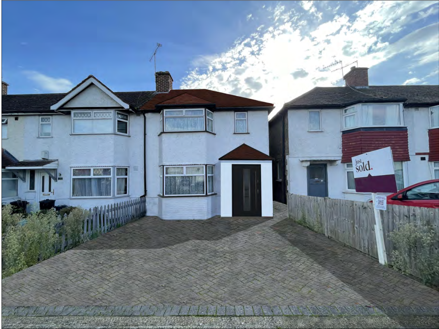
PROPOSED FRONT VIEW