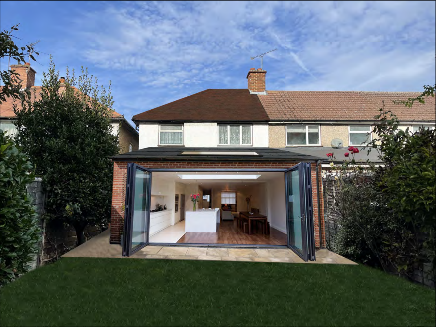
PROPOSED REAR VIEW

THIS DRAWING AND ALL THE INFORMATION CONTAINED HEREIN, COMPLETE WITH THE DESIGN CONCEPT AND INTENT, IS PROTECTED BY COPYRIGHT AND IS THE PROPERTY OF ZD DESIGN LTD. NO PART OF THIS DRAWING OR INFORMATION CONTAINED HEREIN MAY BE REPRODUCED OR TRANSMITTED IN ANY FORM OR BY ANY MEANS, ELECTRONIC OR MECHANICAL, INCLUDING PHOTOCOPYING, RECORDING, OR BY ANY INFORMATION STORAGE AND RETRIEVAL SYSTEM, WITHOUT THE WRITTEN PERMISSION OF ZD DESIGN LTD.