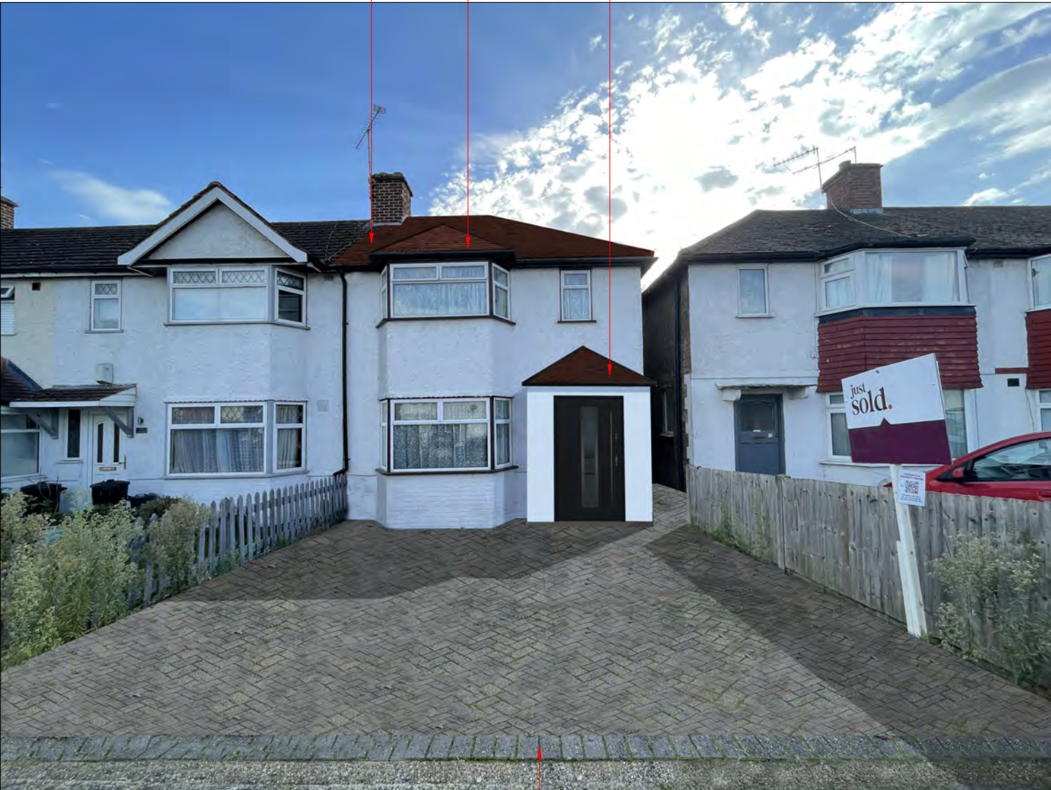
PROPOSED FRONT SITE PICTURE