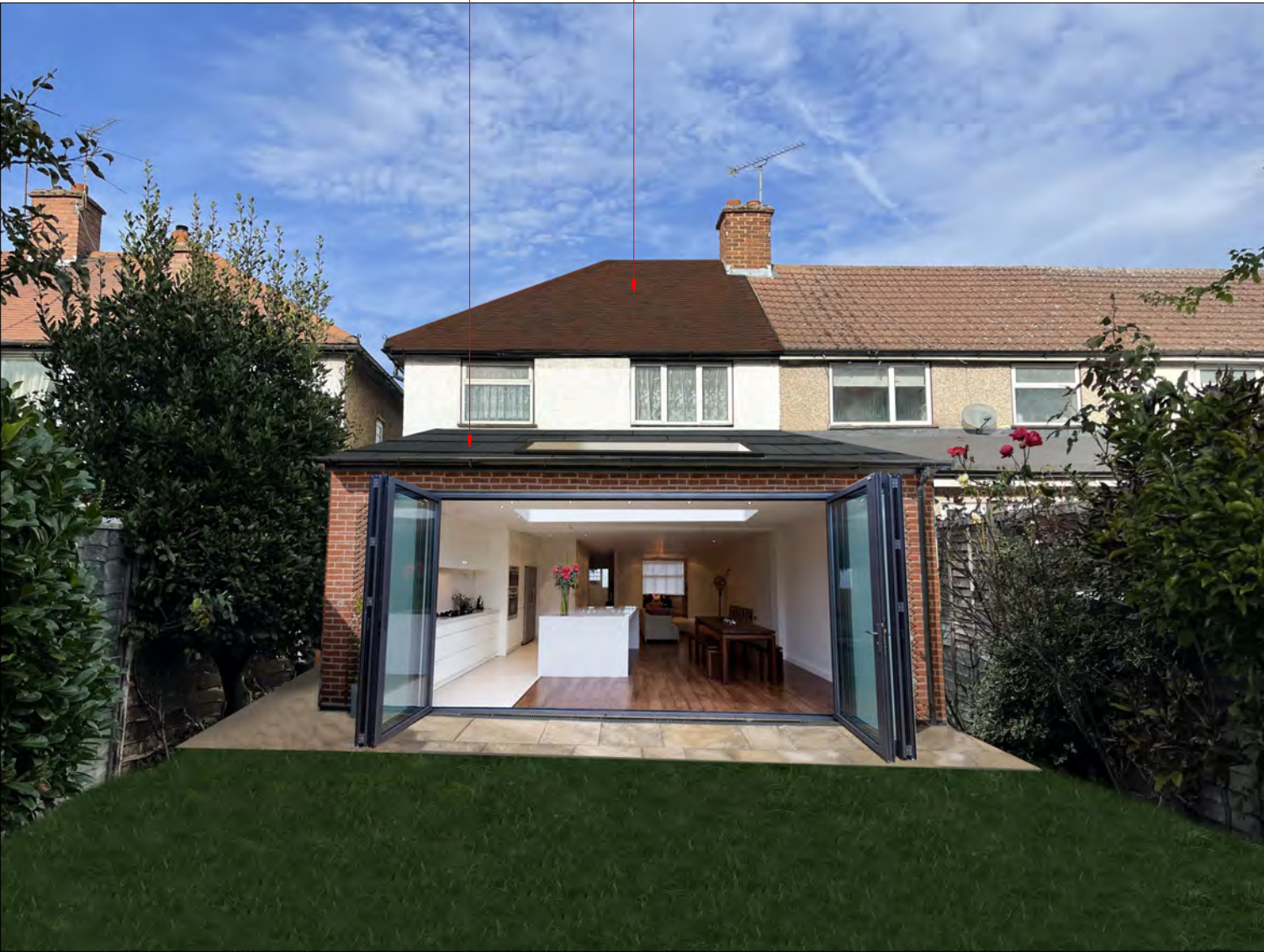
PROPOSED REAR SITE PICTURE

THIS DRAWING AND ALL THE INFORMATION CONTAINED HEREIN, COMPLETE WITH THE DESIGN CONCEPT AND INTENT, IS PROTECTED BY COPYRIGHT AND IS THE PROPERTY OF ZD DESIGN LTD. NO PART OF THIS DRAWING OR THE INFORMATION CONTAINED HEREIN, MAY BE REPRODUCED OR TRANSMITTED IN ANY FORM OR BY ANY MEANS, WITHOUT THE WRITTEN PERMISSION OF ZD DESIGN LTD. ALL MEASUREMENTS ARE IN MILLIMETERS UNLESS OTHERWISE SPECIFIED. IT IS THE CONTRACTOR'S RESPONSIBILITY TO CHECK THE DRAWING AND ANY DESIGN DETAIL FOR THE INTENDED RESULTS.