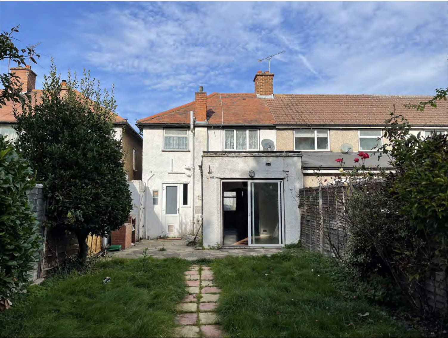
EXISTING REAR SITE PICTURE