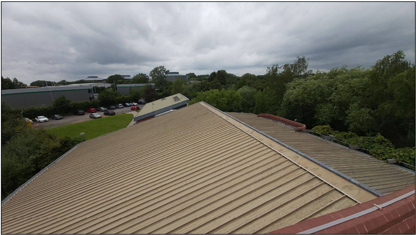
9. VIEW OF ROOF AREA TOWARDS EXISTING OFFICE