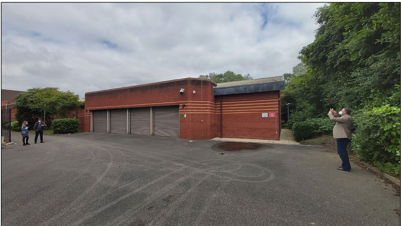
11. VIEW OF EXISTING LOADING DOORS