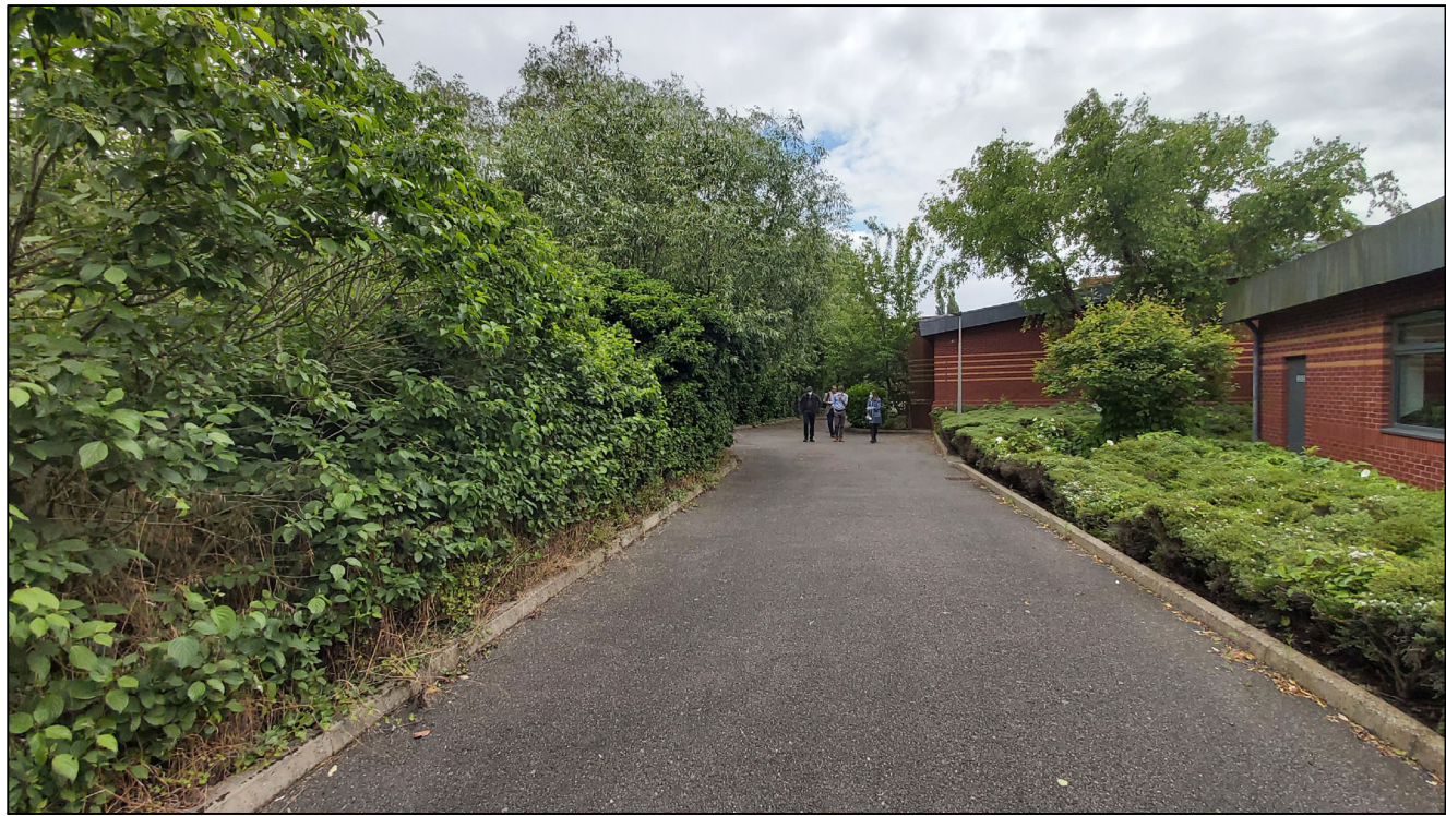
5. VIEW TOWARDS THE CANAL