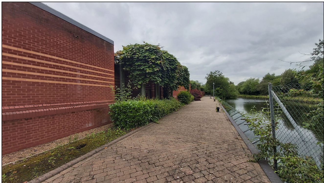
7. VIEW ALONGSIDE THE CANAL BY PROPOSED NEW OFFICE ENTRANCE