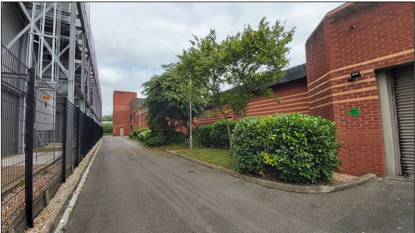
12. VIEW ALONG SOUTHERN ELEVATION AND SERVICE CORRIDOR

SUBJECT TO STATUTORY CONSENTS BASED ON TOPOGRAPHICAL SURVEY 16608 TOPO-2D (07-08-14) BASED ON OS MAP REPRODUCED BY PERMISSION OF CONTROLLER OF HM STATIONARY OFFICE (c) CROWN COPYRIGHT COPYRIGHT RESERVED DO NOT USE ELECTRONIC VERSIONS OF THIS DRAWING TO DETERMINE DIMENSIONS UNLESS SPECIFICALLY AUTHORISED BY MICHAEL SPARKS ASSOCIATES IF USING AN ELECTRONIC VERSION OF THIS DRAWING FIGURED DIMENSIONS TAKE PRECEDENCE AND NOTIFY MICHAEL SPARKS ASSOCIATES OF ANY DISCREPANCIES