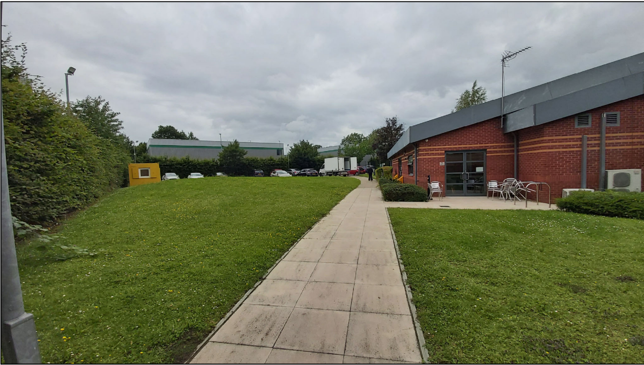
2. VIEW TOWARDS THE EXISTING CAR PARK