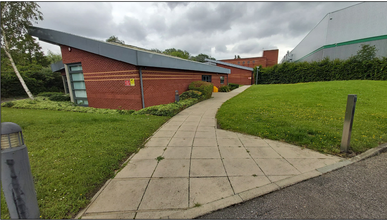
1. VIEW TOWARDS THE EXISTING OFFICES