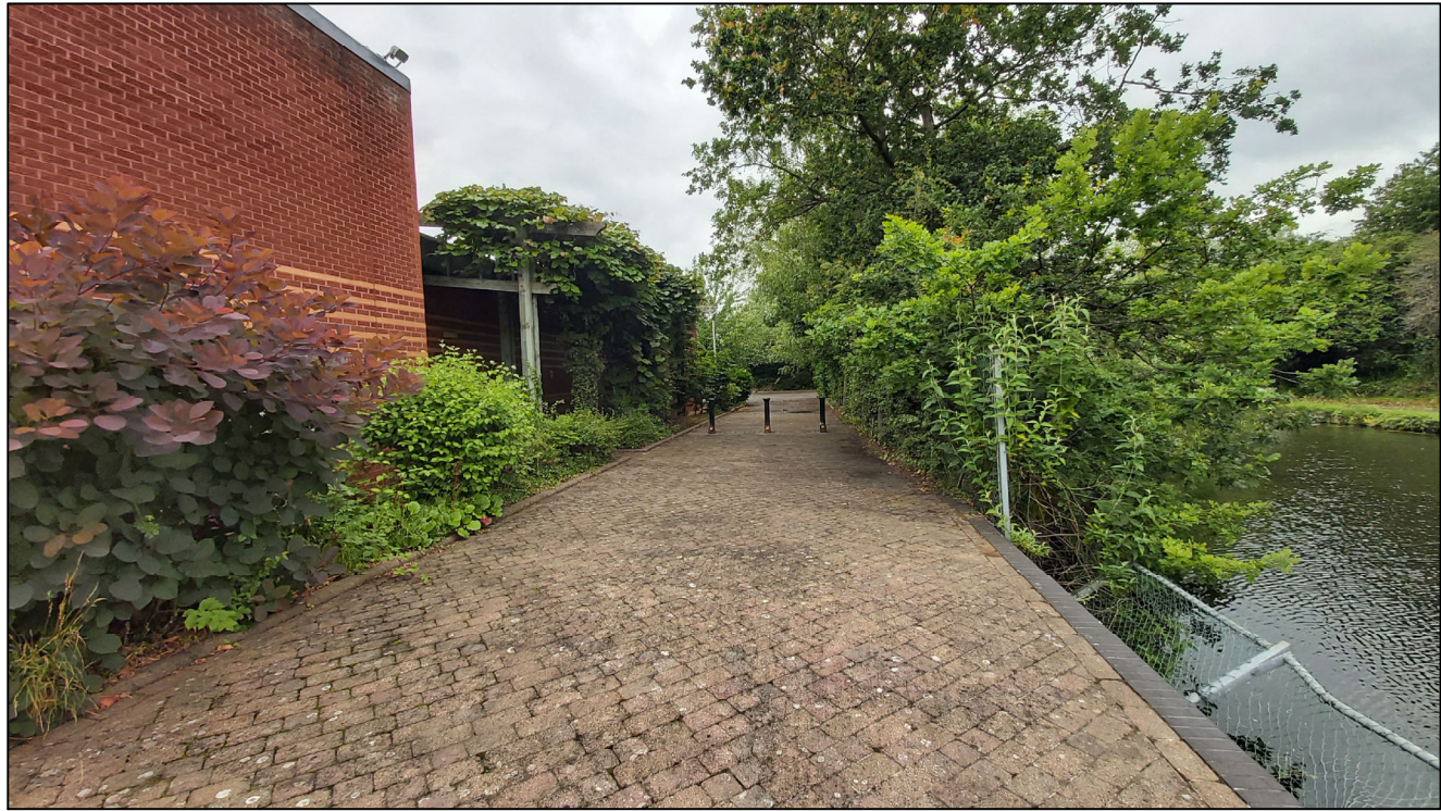
6. VIEW ALONGSIDE THE CANAL TOWARDS THE OFFICES