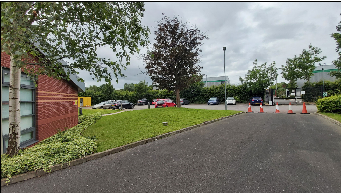
4. VIEW FROM OFFICE TOWARDS THE CAR PARK