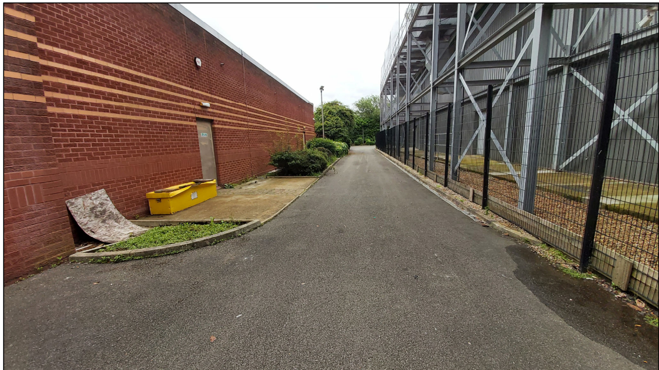
8. VIEW ALONG SOUTHERN ELEVATION AND SERVICE CORRIDOR