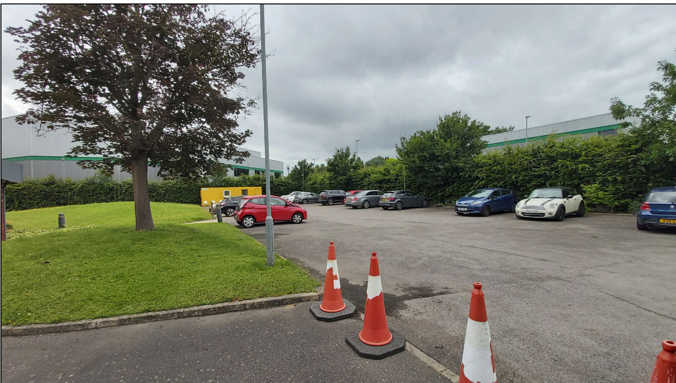
3. VIEW OF EXISTING CAR PARK