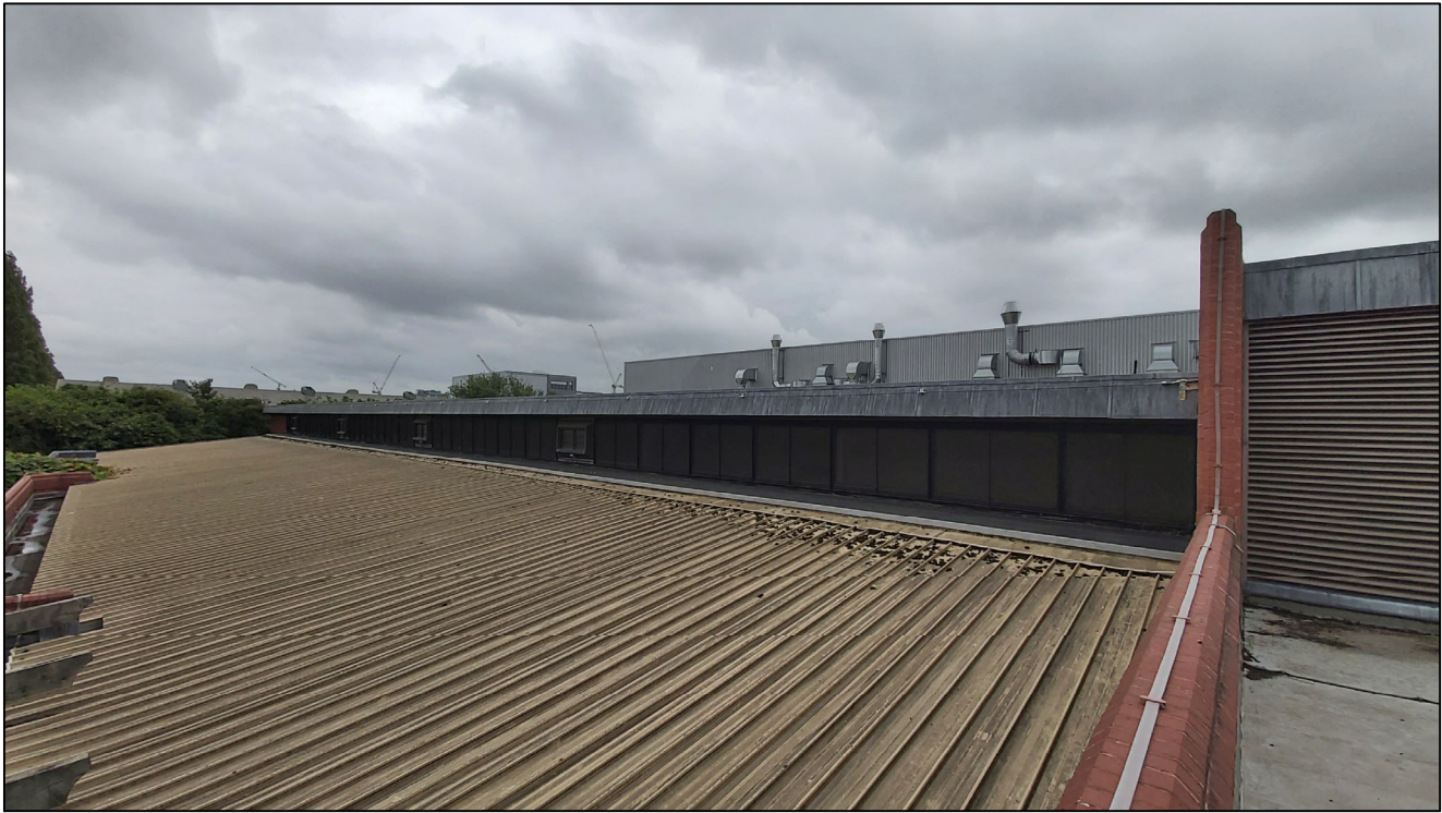
10. VIEW OF ROOF AREA TO MAIN BUILDING