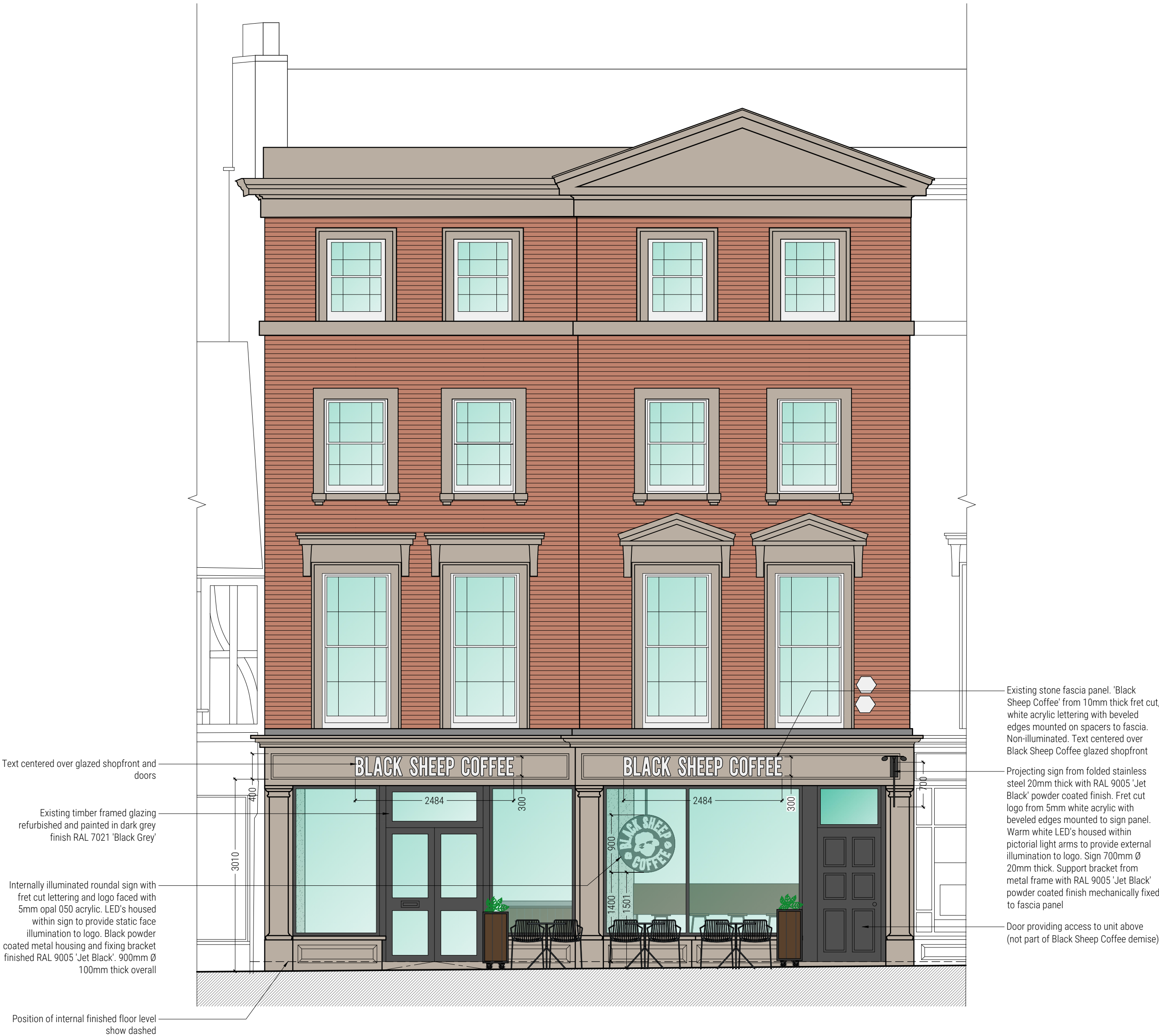
Proposed Shopfront Elevation