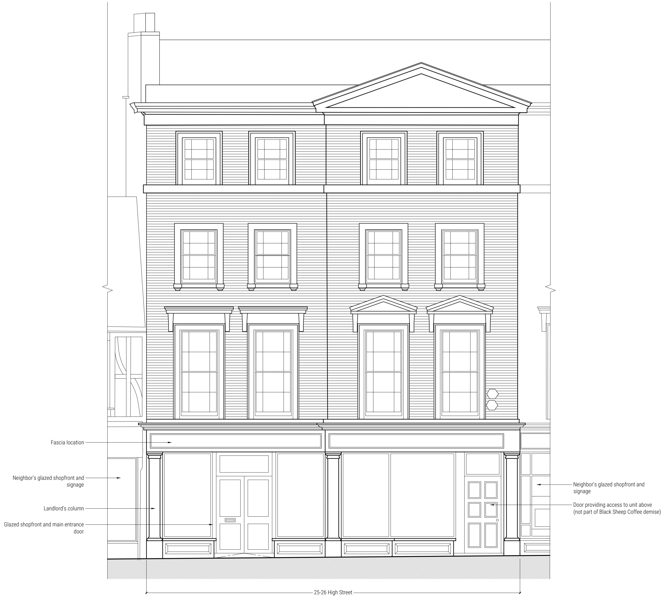
Existing Shopfront Elevation